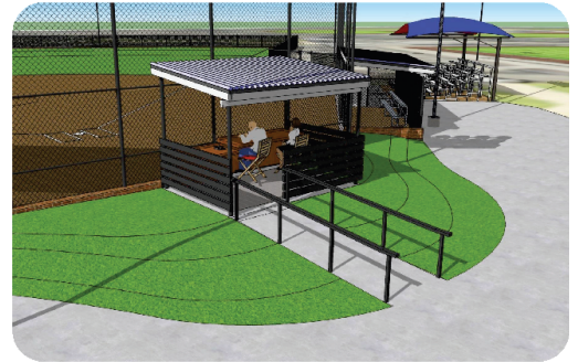
Backstop dugout scoring area