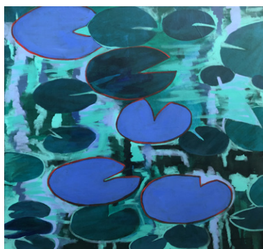
Image Left to Right: Mario Marzan, Born on the Moon , 2016, Installation of multiple paintings/drawings—Dimensions Variable (Roughly 6" x 6" each), Acrylic and Pencil on Wood Panels; Natacha Sochat, Lily Pond I , 2021, 36"x36", Acrylic on Canvas