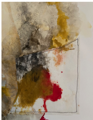
Nora Phillips, Veintinueve , 11"x 14", Mixed Media on Paper