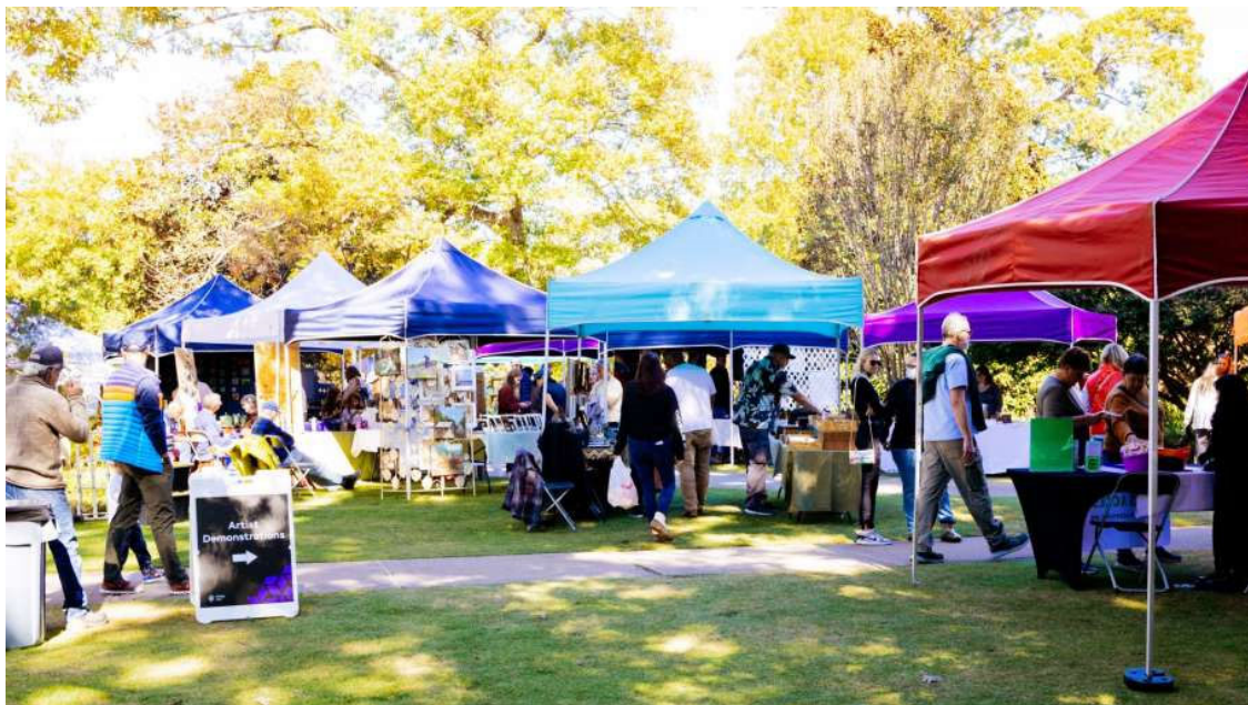
Image Description: showing multiple colored tents with local artists and their work for sale, set up along a concrete walkway.

The Fall Arts Fair is an annual event to showcase the work of bookmakers, fiber artists, glass artists, jewelers, painters, photographers, potters, and printmakers who participate in Pullen and Sertoma Arts Centers' programs. This free outdoor event is a fun outing for the whole family. Visitors can participate in hands-on art activities and watch demonstrations by arts center teaching artists.