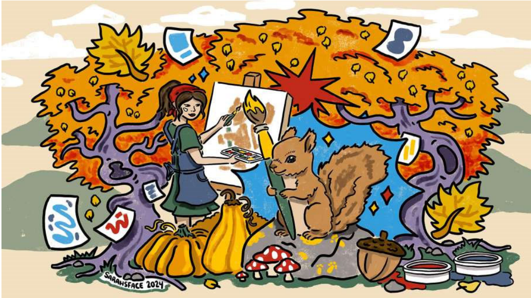
Image Description: Illustration by Sarahlaine Calva of an artist painting on a canvas. In the background are two orange leaved trees that have paintings hanging from them. In the middle of the image is a brown squirrel and a young woman painting, each holding yellow dipped paint brushes.