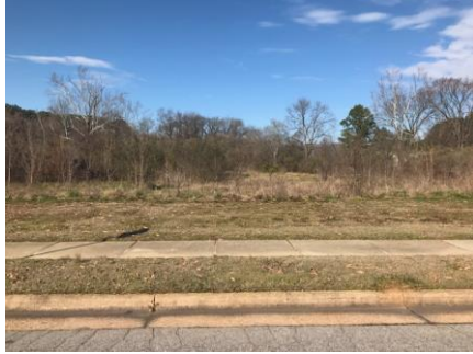
Future Gravel Wetland