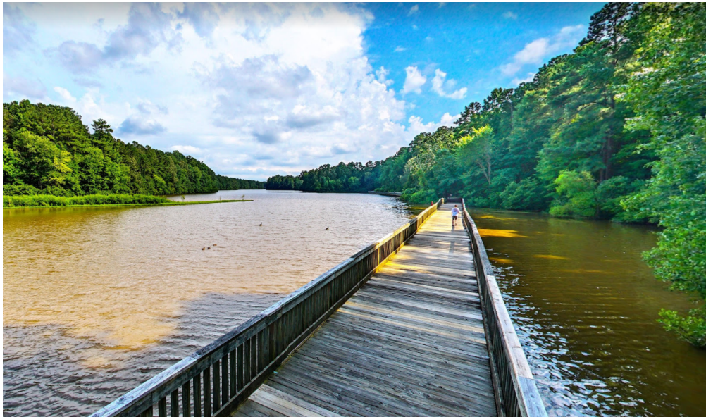
Lake Lynn Boardwalk