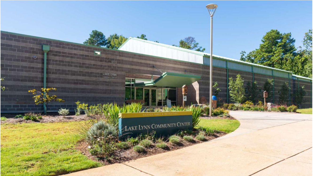
Lake Lynn Community Center