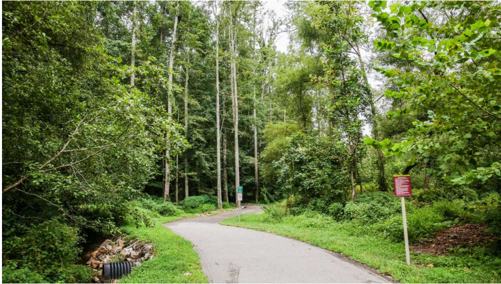
Lake Lynn Trail