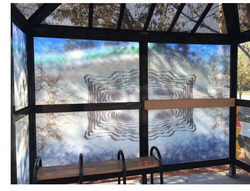
Scott Hazard - Cloud Chambers