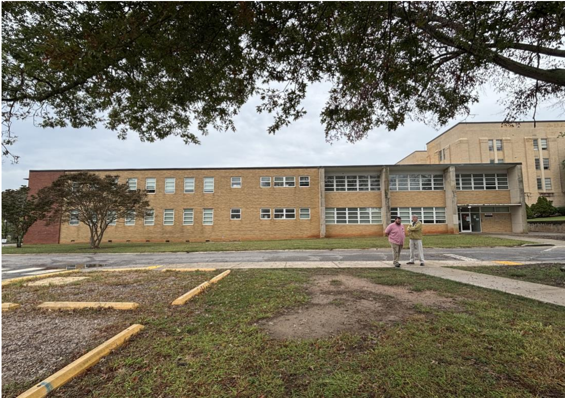
Potential Mural Location: Dobbins Extension at Dix Park