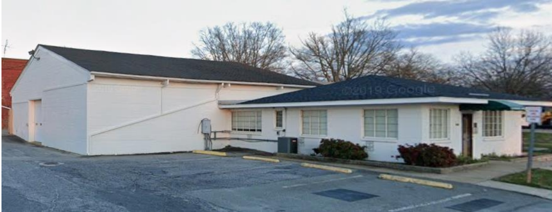
Potential Mural Location: 805 Whiteside, the interim Play Plaza team office/storage location.