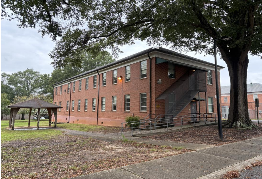
Potential Mural Location: The Hoey Building at Dix Park