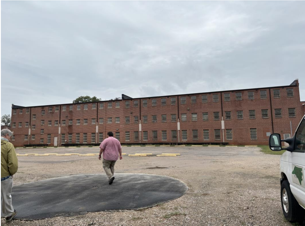
Potential Mural Location: The Spruill building at Dix Park