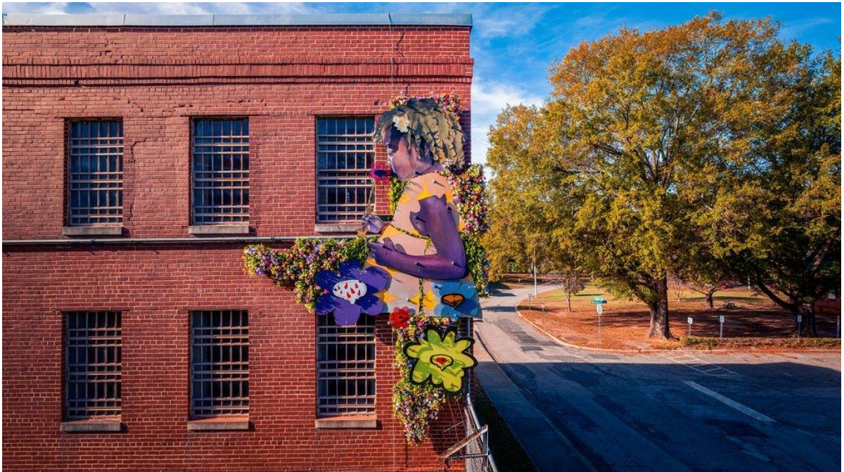
Get Well Soon , a temporary public art installation by artist Lamar Whidbee, located on Spruill Building.

Call for Artists / Request for Qualifications