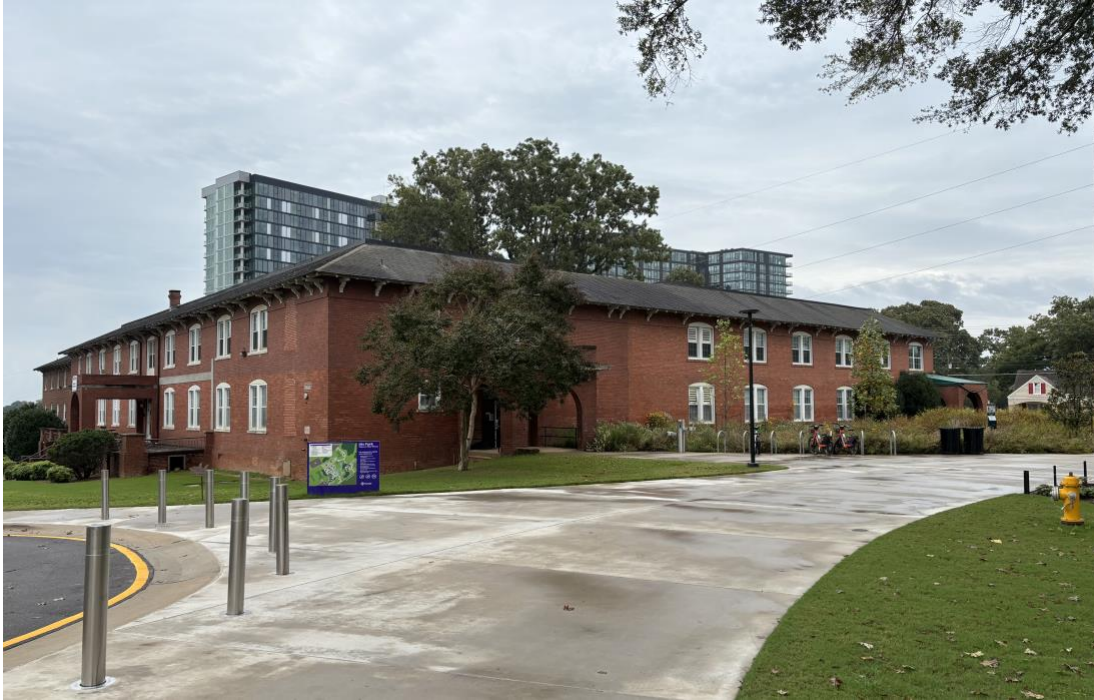
Potential Mural Location: Anderson Building at Dix Park