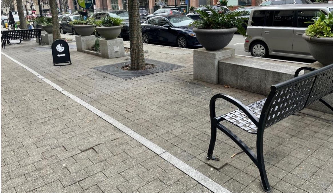
The backside of the planters along Fayetteville Street. Viewshed artists are invited to think about how they might activate this area between the walkway and the street- as defined by the granite line in the sidewalk pavers.