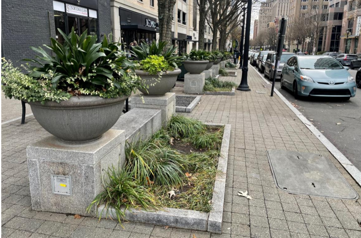
An example of sidewalk planters along Fayetteville Street. Viewshed artists will place artwork in each of the rectangular planters in their assigned area.