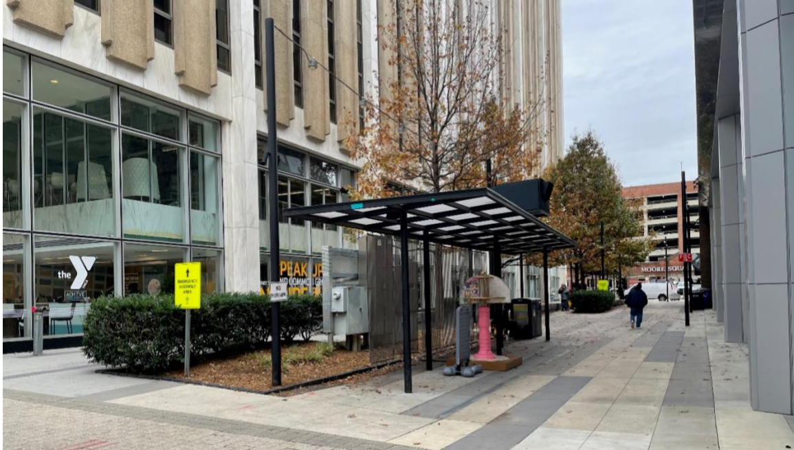
Market Plaza looking west