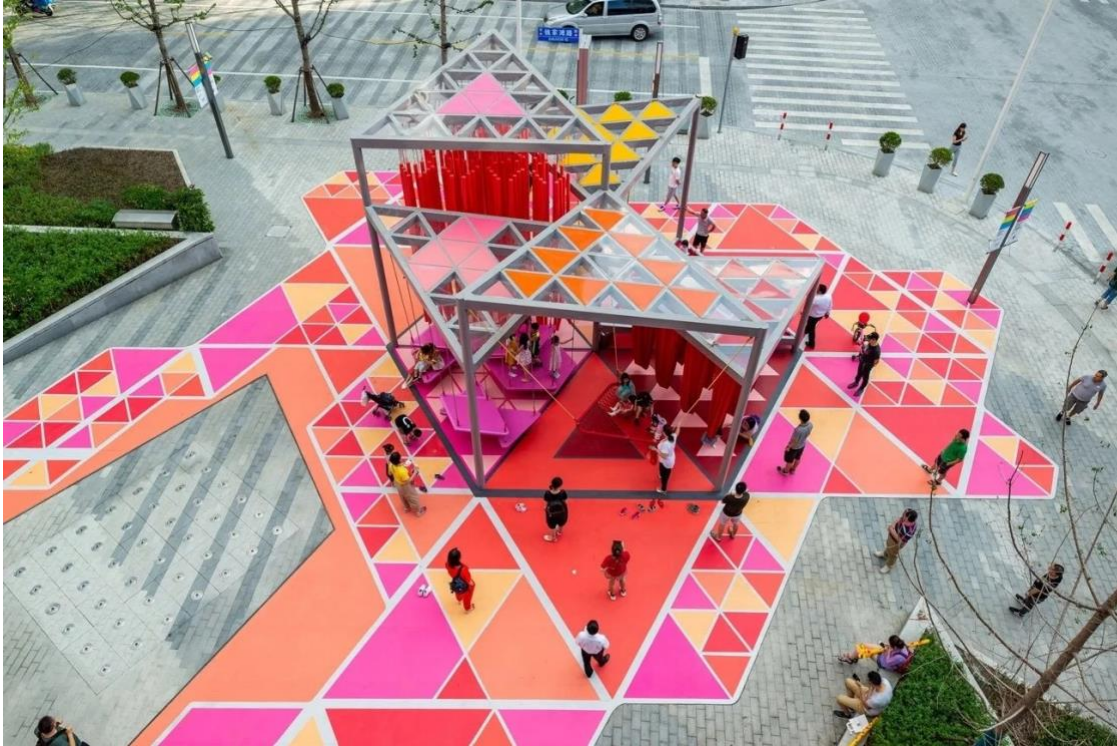
Precedent: "Hang Out" by 100 Architects in Shanghai