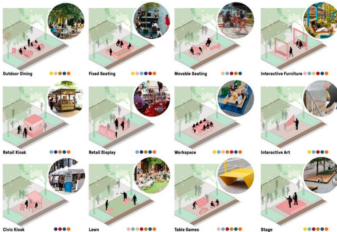
Image from the Activation Toolkit for Fayetteville Street from City of Raleigh's Fayetteville Street Streetscape Plan project (Plan by McAdams and SWA/Balsley)