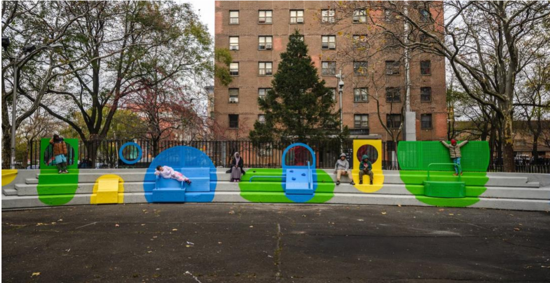
Precedent: "Common Corner" by Urban Conga, 2025, Bronx, NY

The project budget for creating artistic wayfinding and seating is $300,000. This budget is inclusive of design, artwork fabrication, delivery, installation, taxes, artist travel, and fees. The City of Raleigh will hold separate funds for community engagement (non-inclusive of travel and artist expenses).