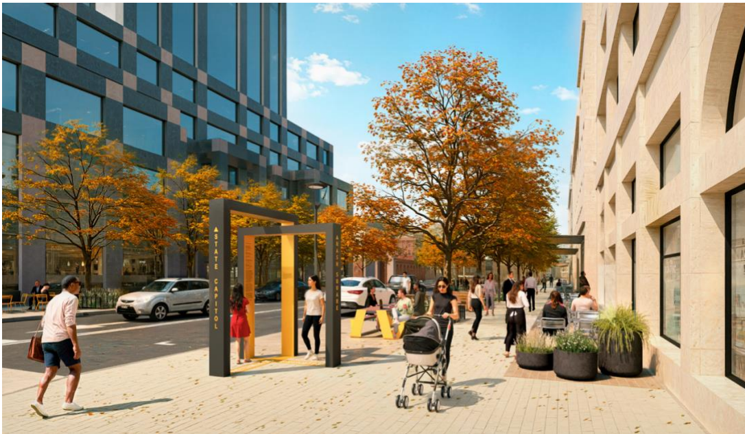
Rendering of potential wayfinding from City of Raleigh's Fayetteville Street Streetscape Plan. (Plan by McAdams and SWA/Balsley).