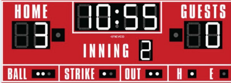
03 NEW SCORE BOARD