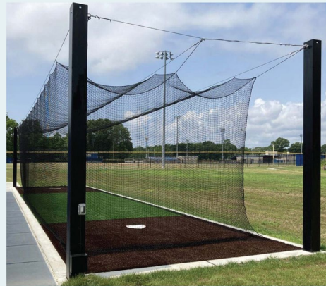
02 BATTING CAGE