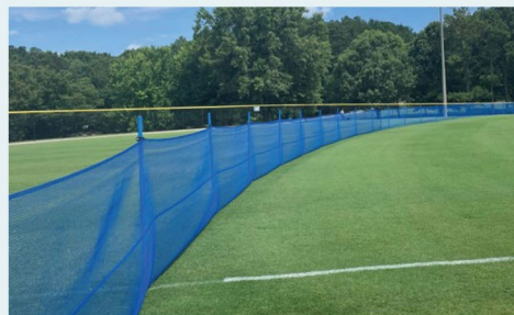
04 MOVABLE FENCING