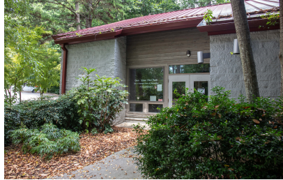
Glen Eden Pilot Park - #35 Glen Eden Drive 27612 919-996-2767