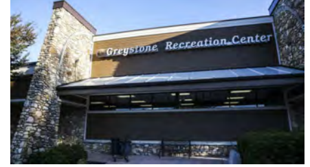
Greystone Recreation Center - #12 7713-55 Leadmine Road 27615 919-996-4848