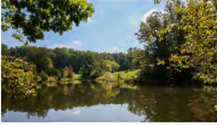
A.L. Wilkerson Nature Preserve - #9 5229 Awls Haven Drive 27614 919-996-6764