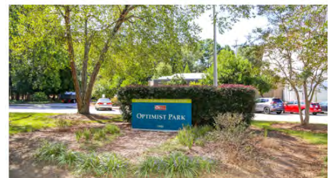
Optimist Community Center - #24 5900 Whittier Drive 27609 919-996-2880