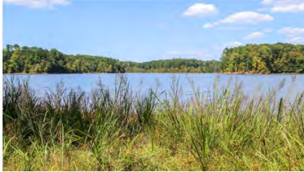
Forest Ridge Park - #37 2100 Old N 98 Hwy, Wake Forest 27587 919-996-5800