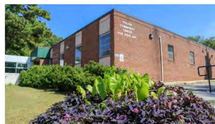
Pullen Community Center - #27 108 Ashe Ave 27607 919-996-6052