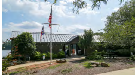
Lake Johnson Waterfront Center - #18 4601 Avent Ferry Road 27606 919-996-3141