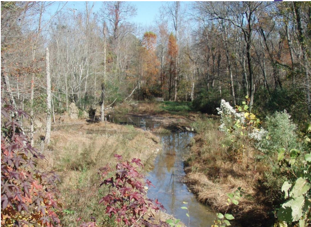
Stream within Kyle Drive Park

Call for Artists | Request for Qualifications