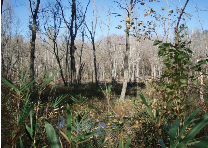
A colony of river cane along the edge of the Beaverdam Wetland

The project timeline for planning, design and construction of these improvements runs from 2023-2028.