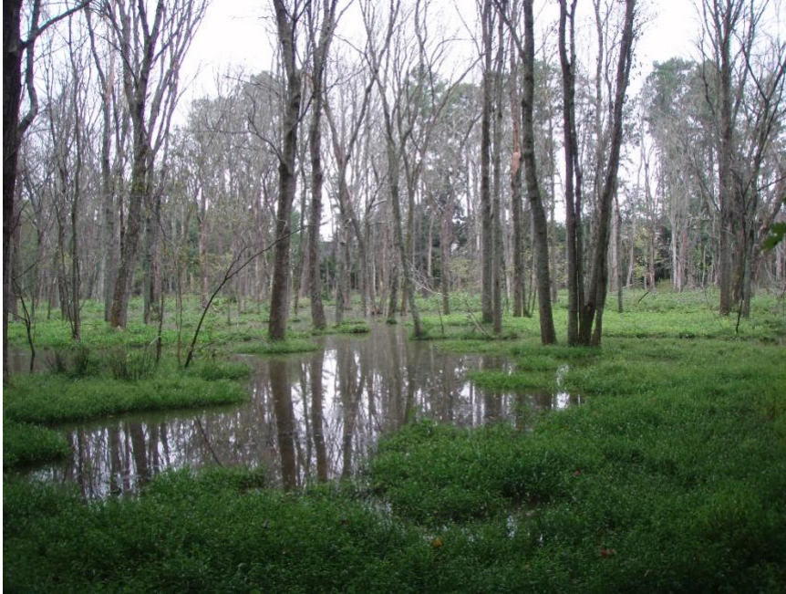
Beaverdam Creek Wetland within Kyle Drive Park