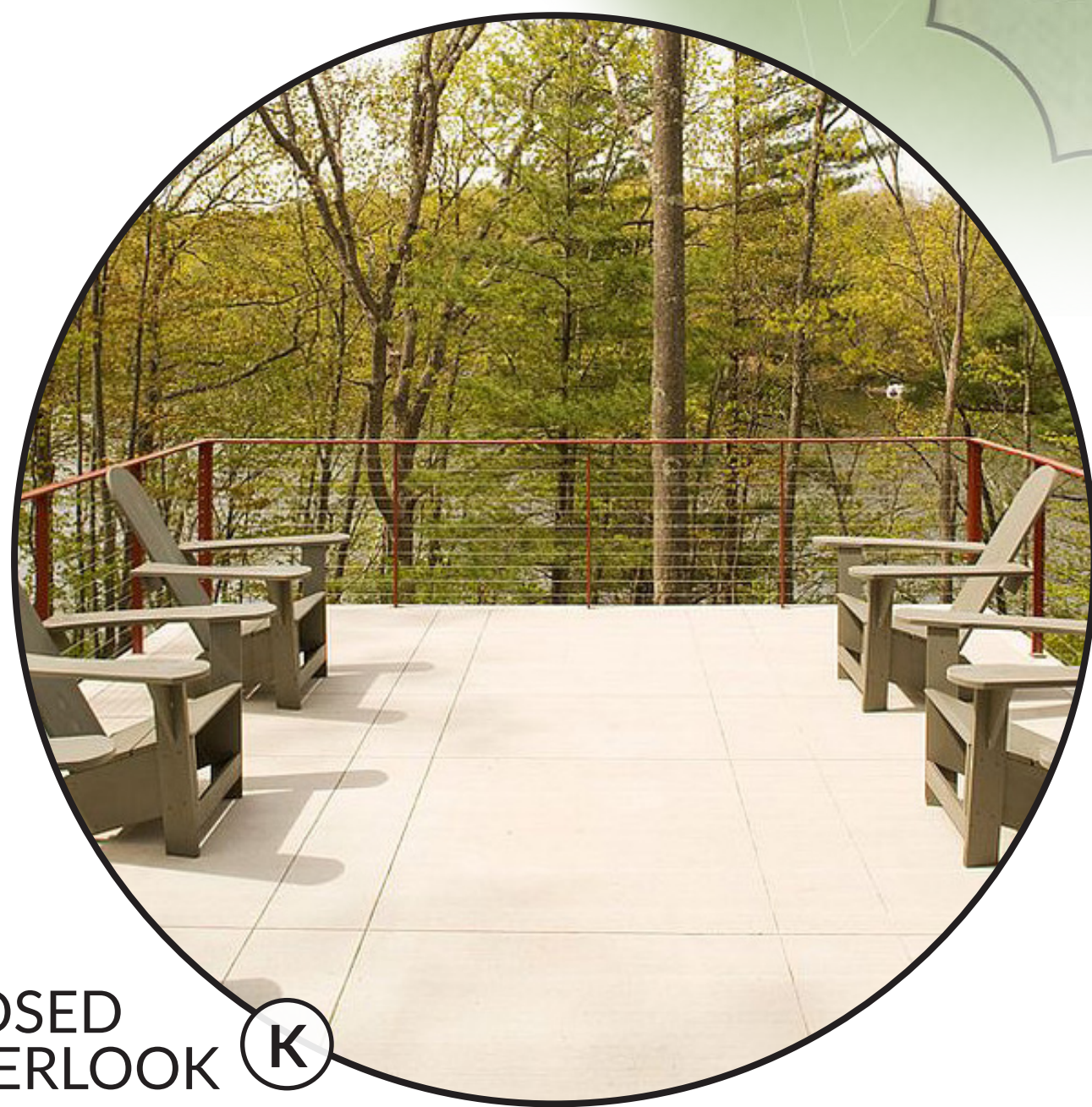
PROPOSED POND OVERLOOK