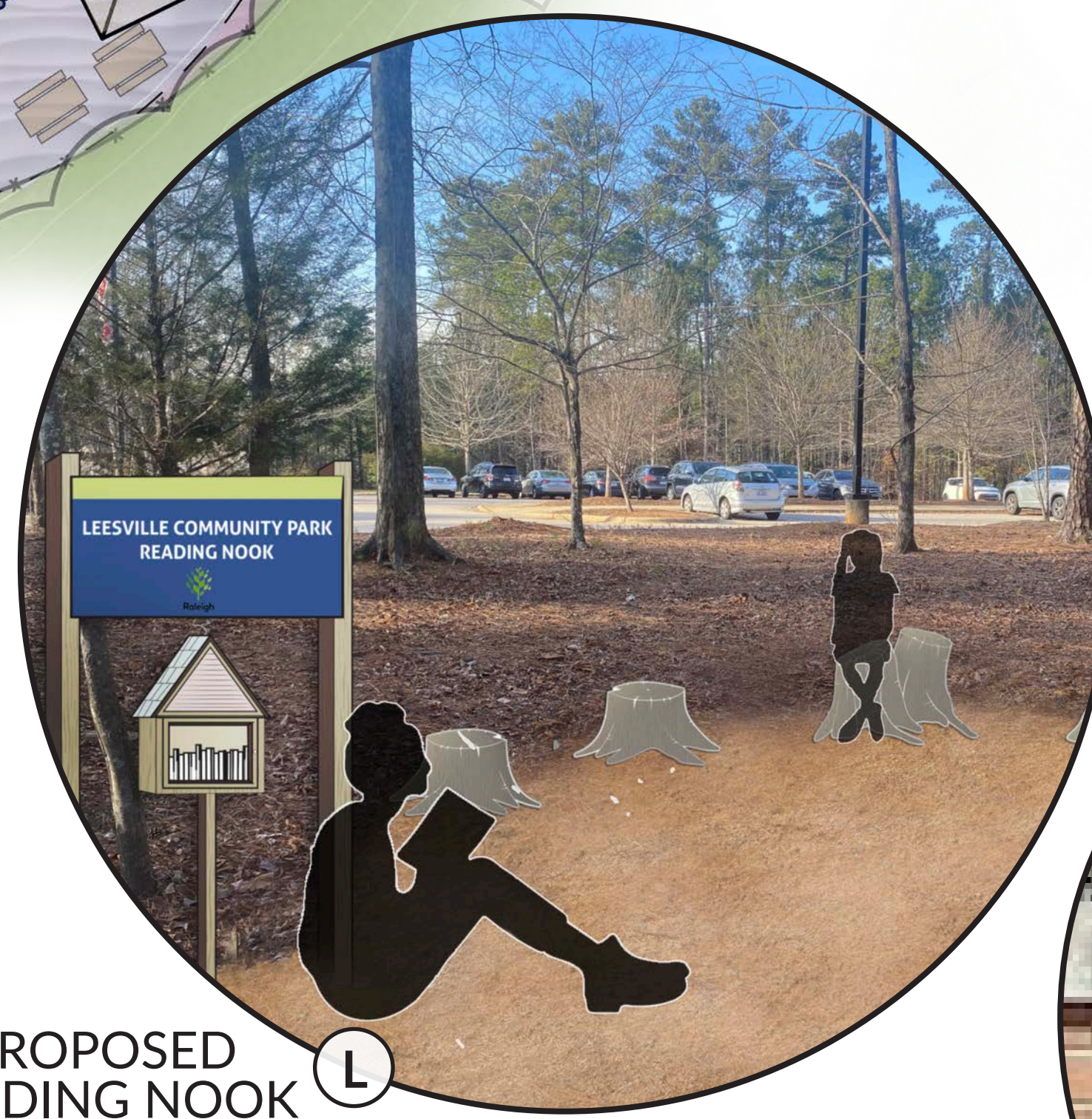
PROPOSED READING NOOK L