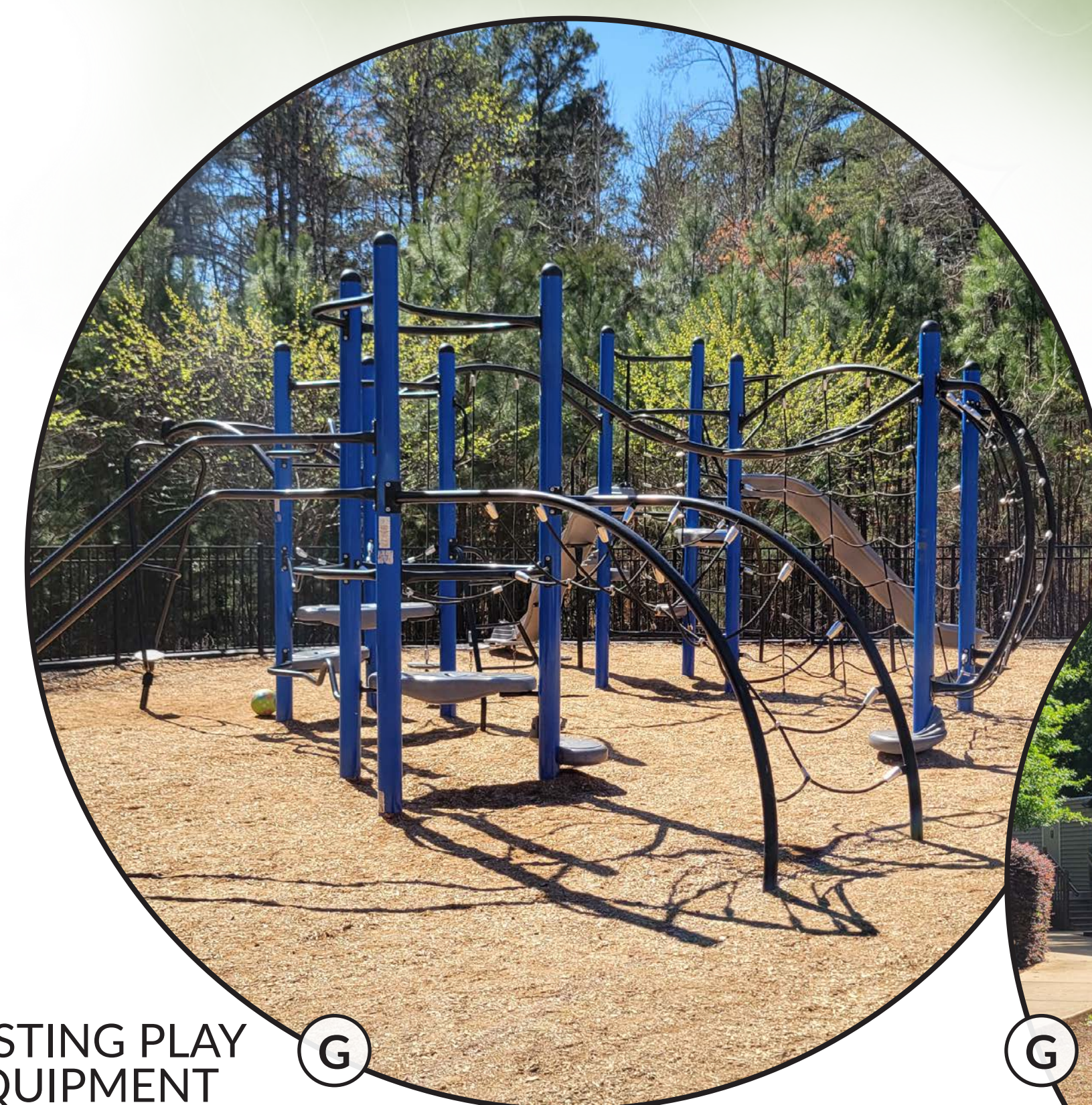
EXISTING PLAY EQUIPMENT (G)