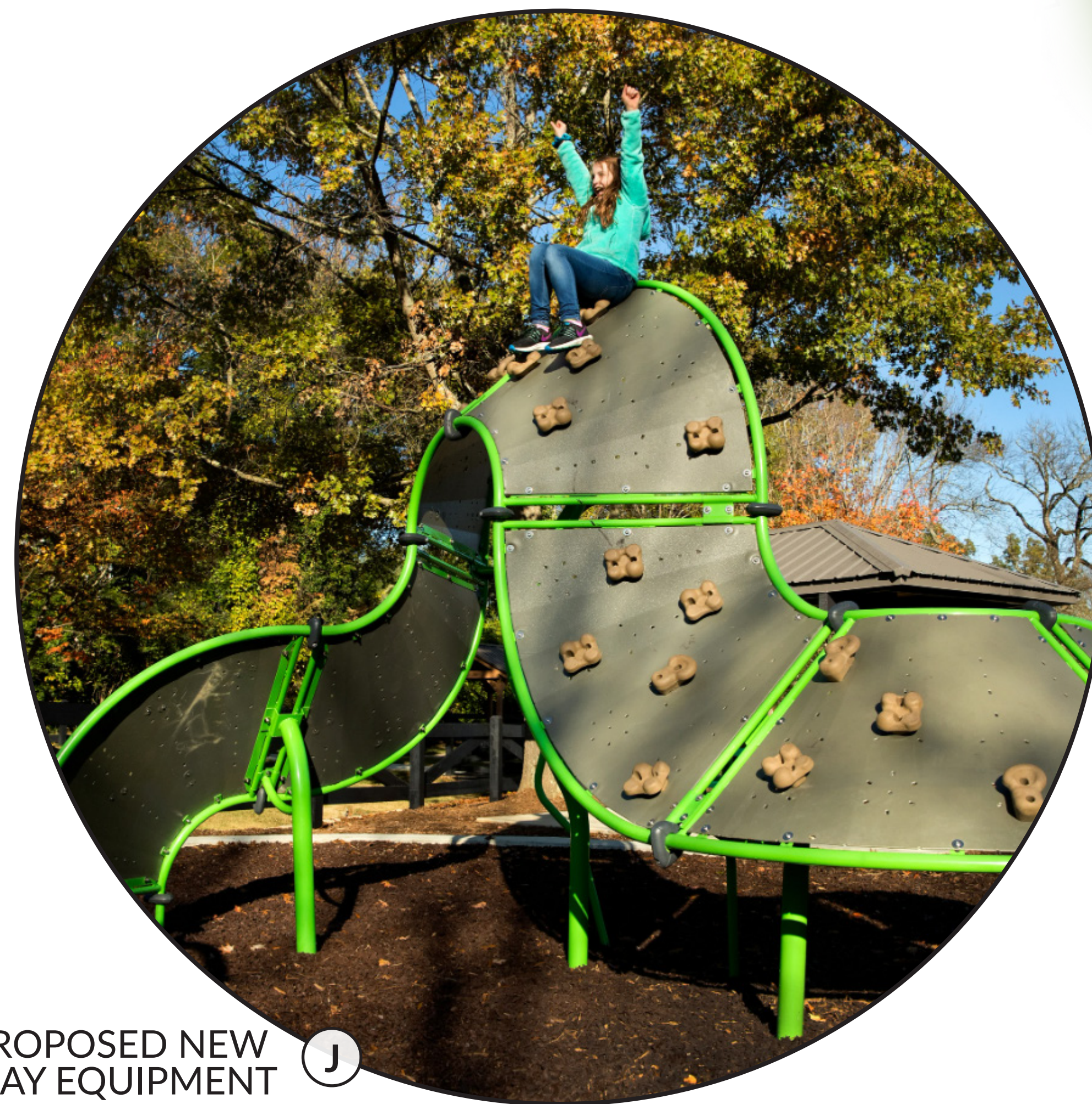
PROPOSED NEW PLAY EQUIPMENT J