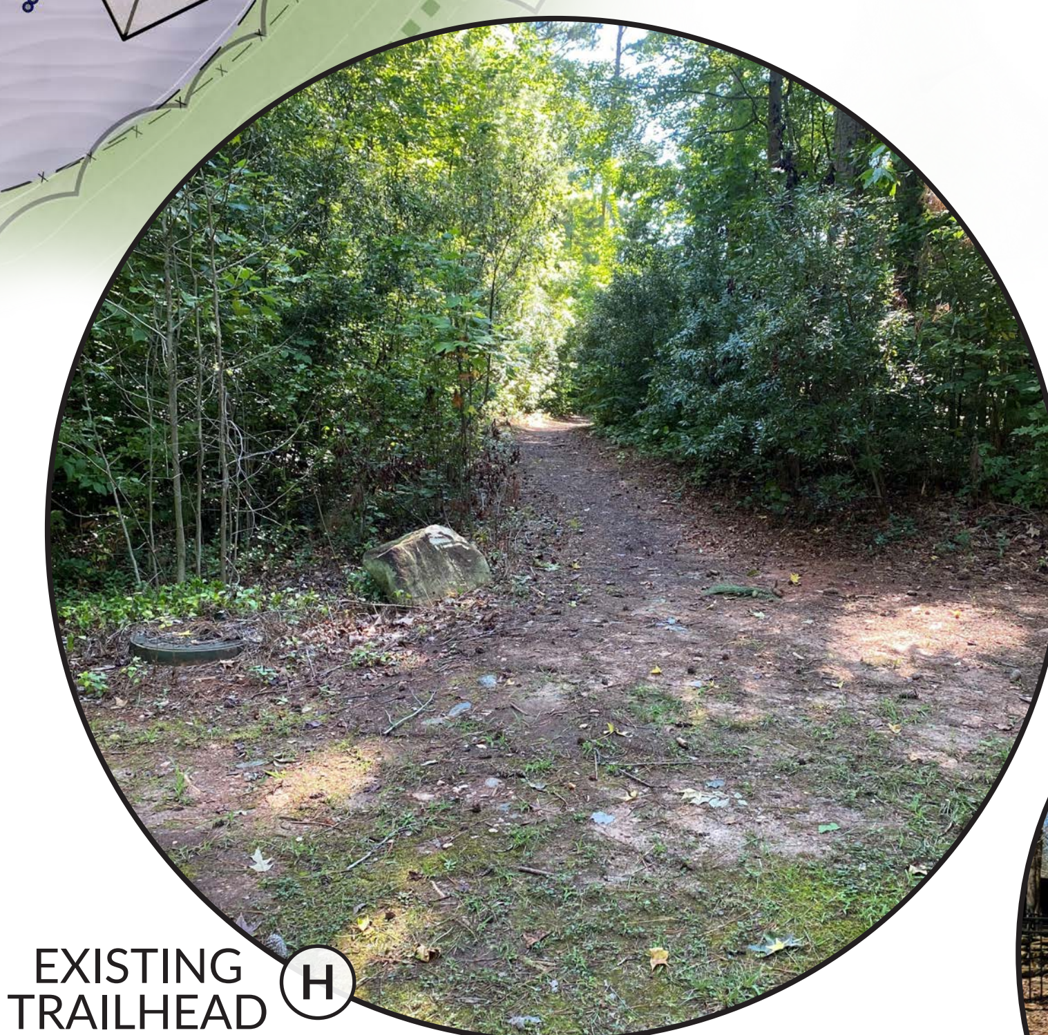
EXISTING TRAILHEAD (H)