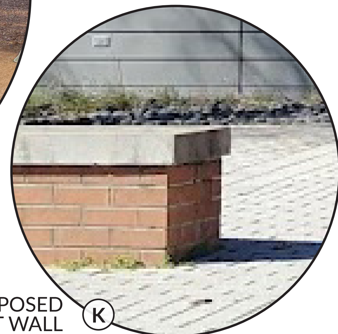
PROPOSED SEAT WALL K