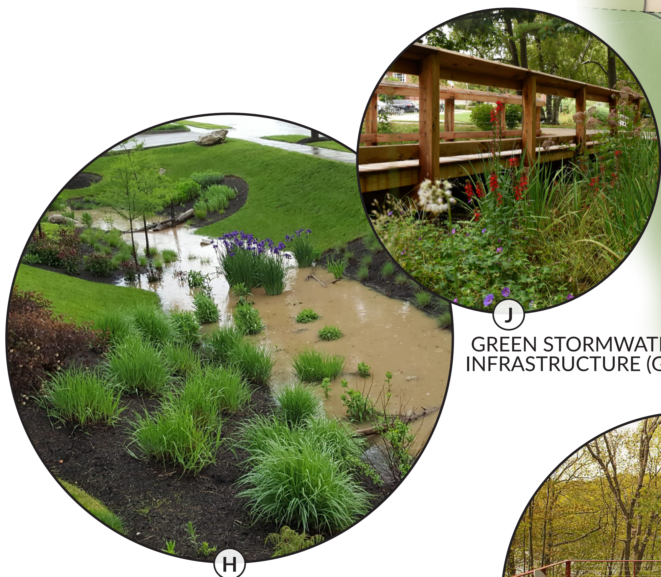
GREEN STORMWATER INFRASTRUCTURE (GSI)