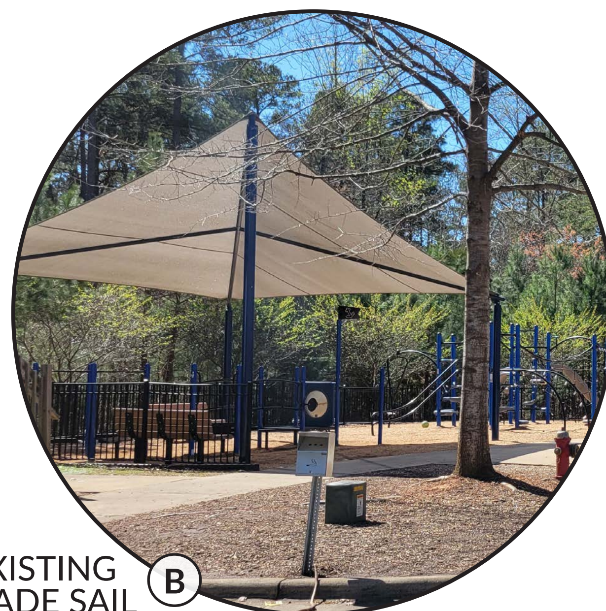
EXISTING SHADE SAIL (B)