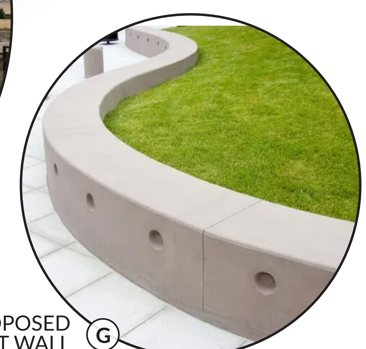
PROPOSED SEAT WALL