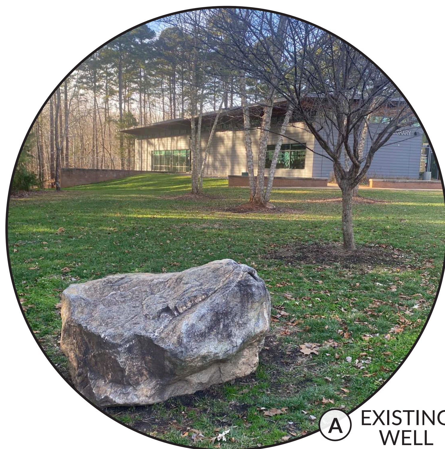
(A) EXISTING WELL