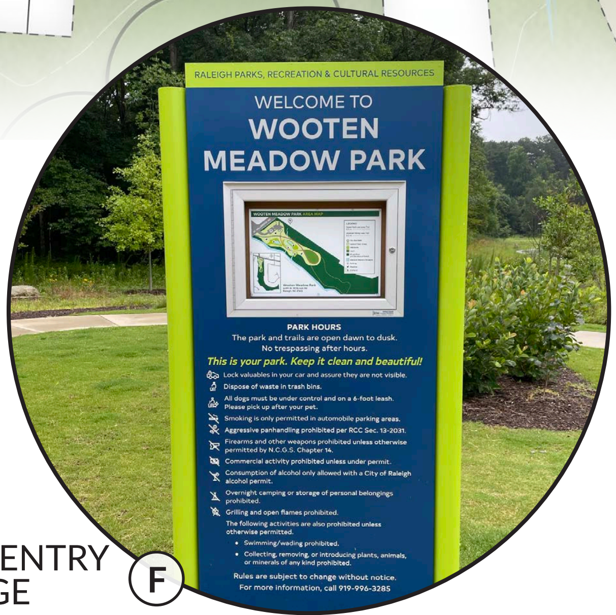
PROPOSED ENTRY SIGNAGE