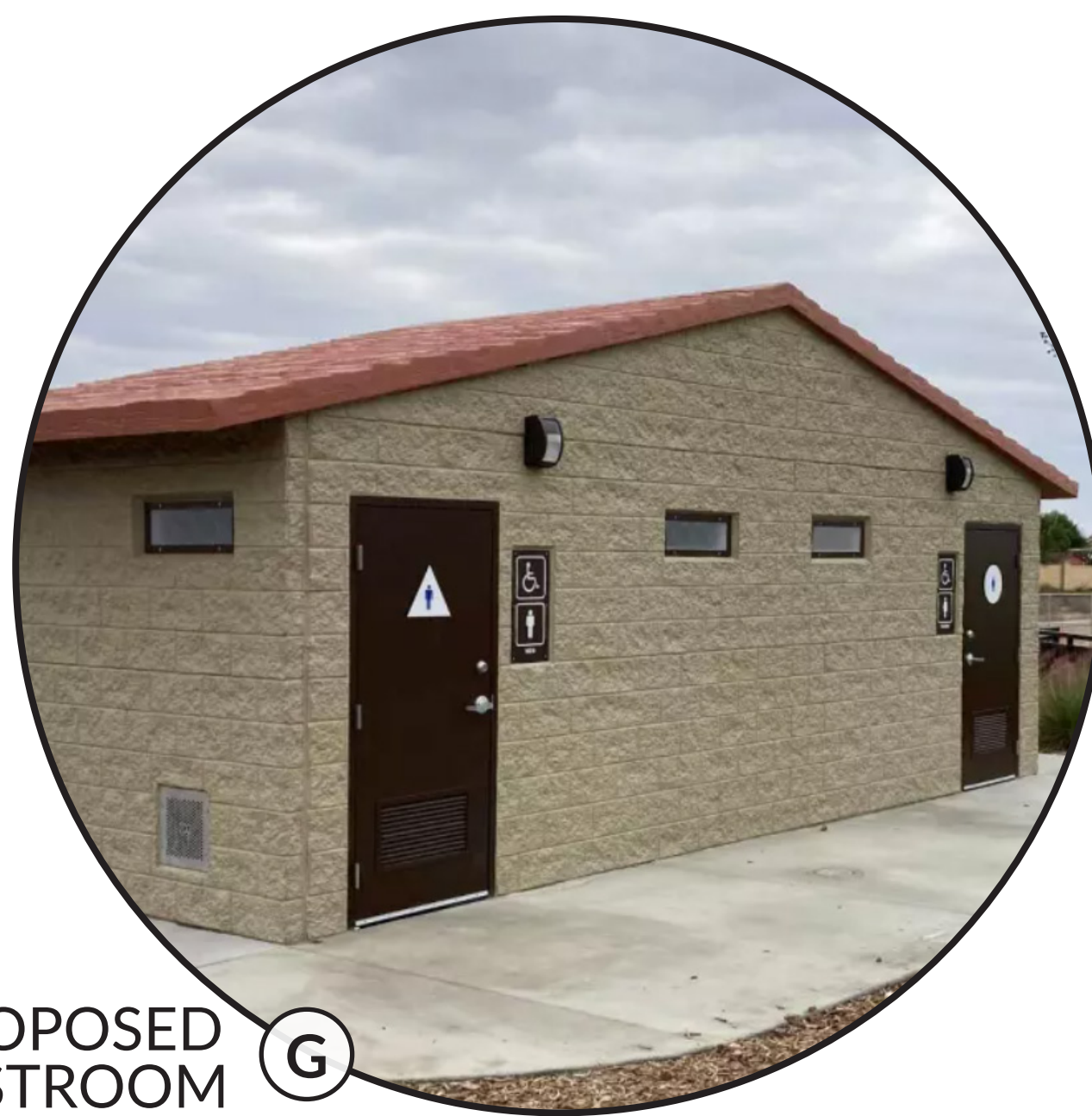
PROPOSED RESTROOM G