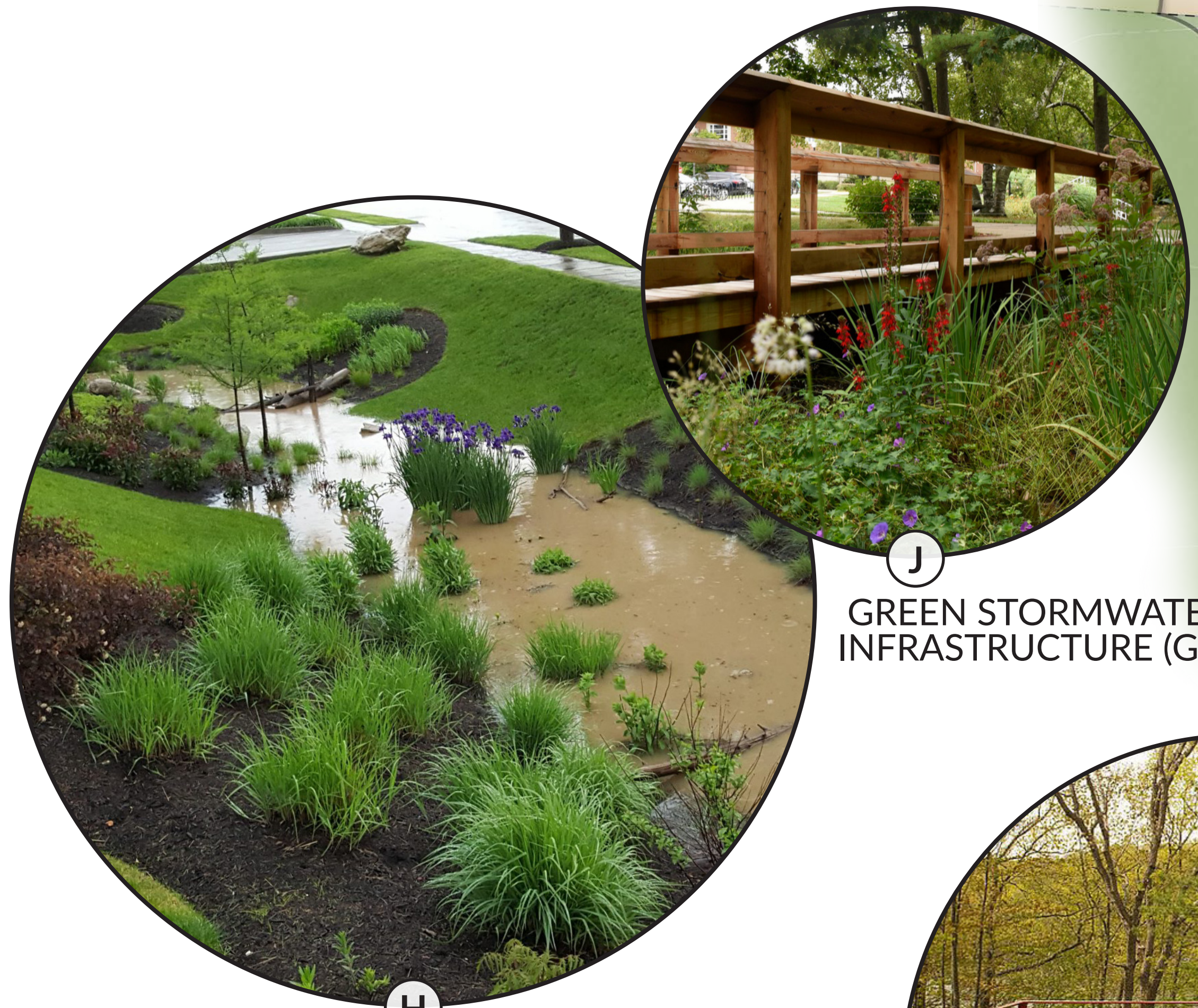
GREEN STORMWATER INFRASTRUCTURE (GSI)