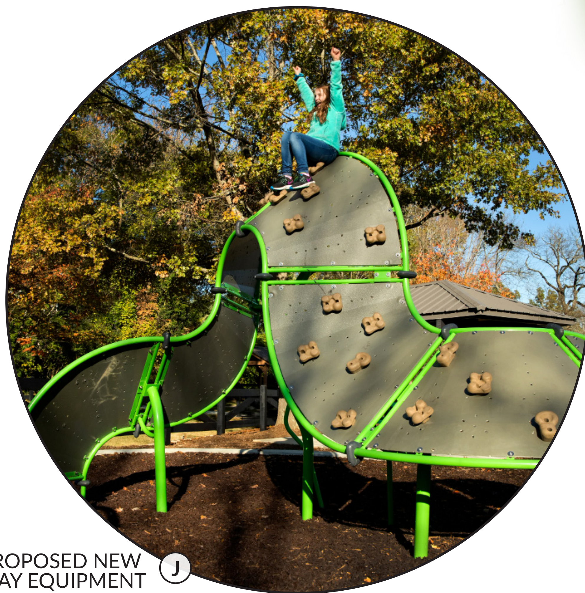
PROPOSED NEW PLAY EQUIPMENT J