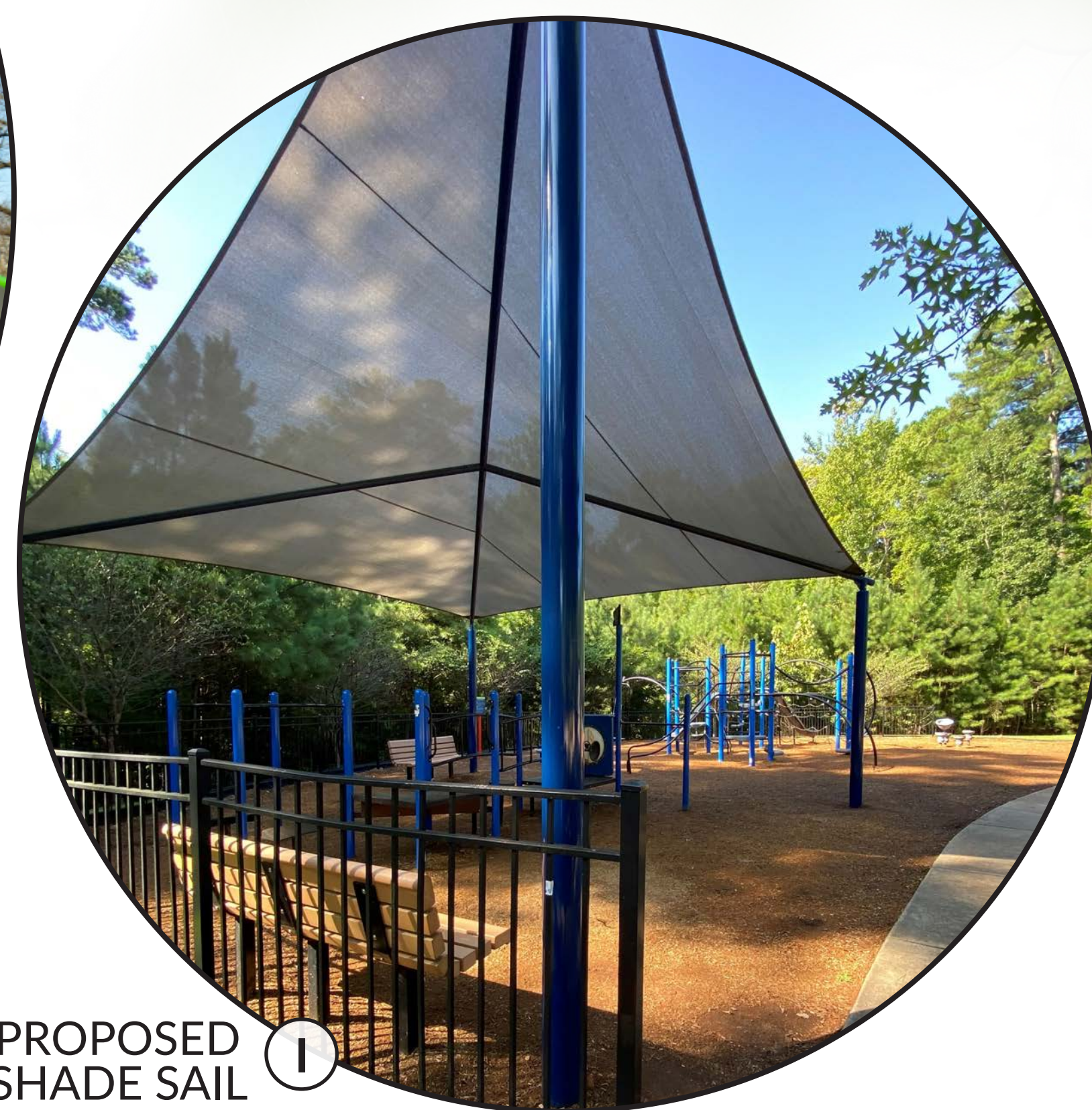
PROPOSED SHADE SAIL I