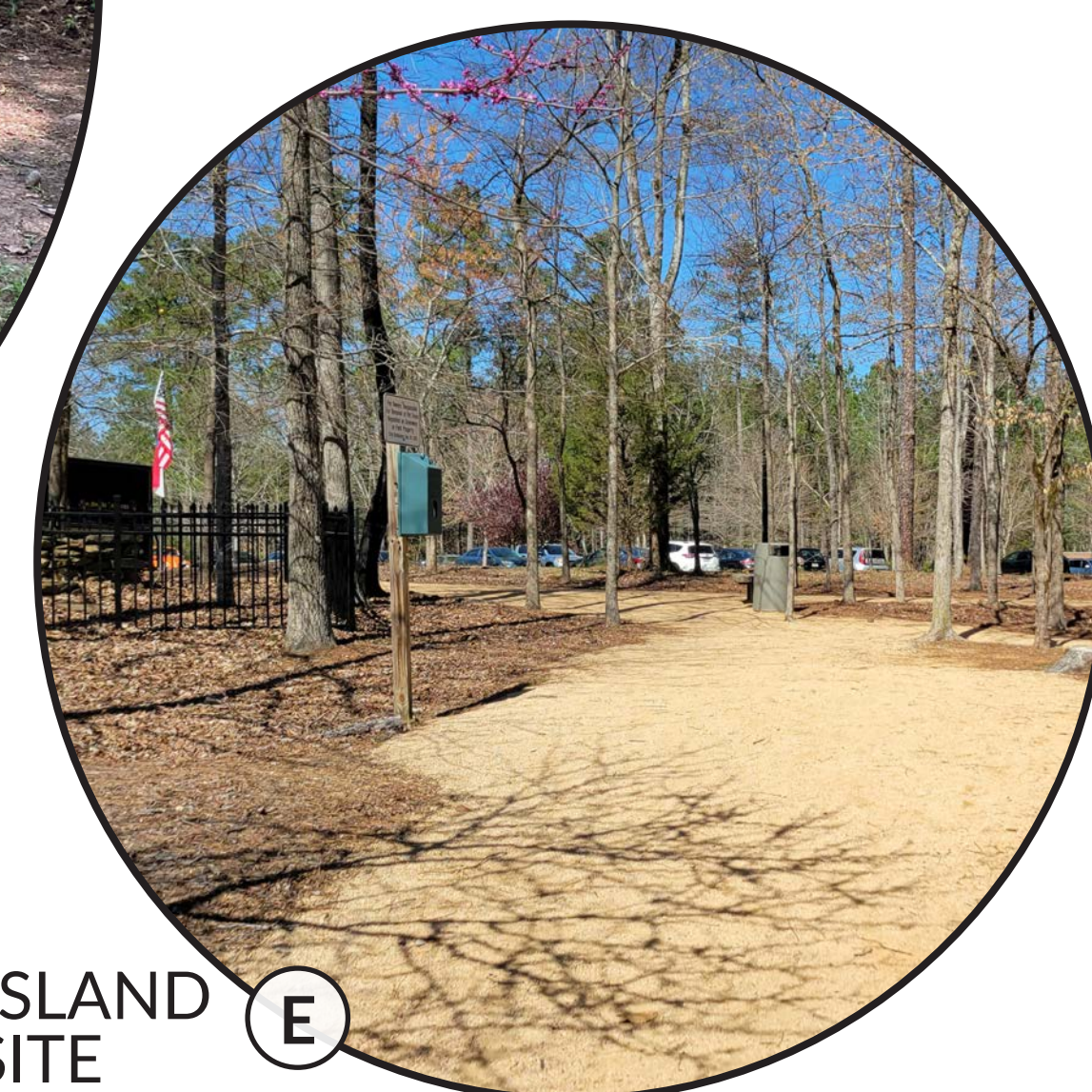
CENTRAL PARKING ISLAND & HOMESTEAD SITE (E)