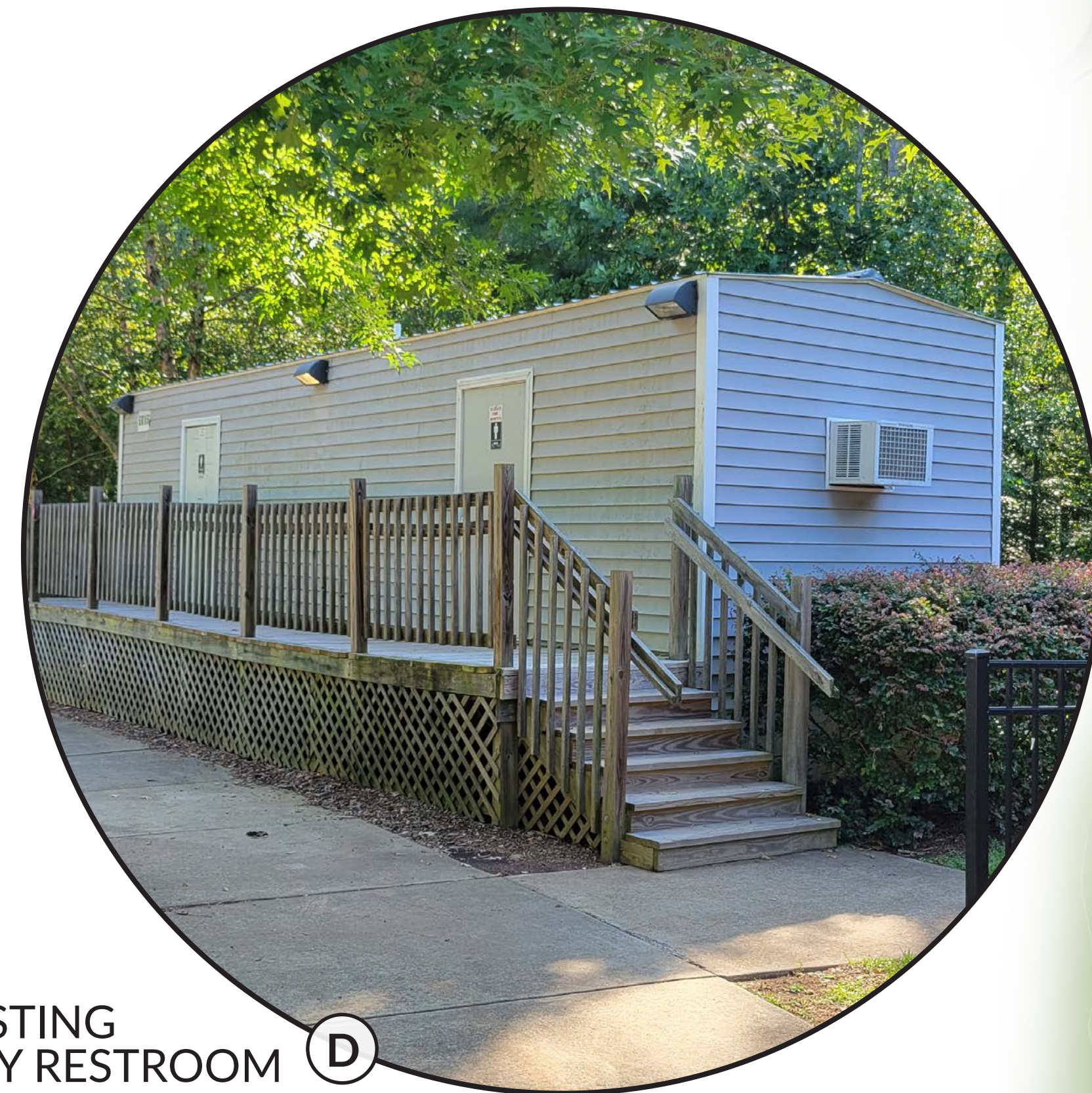
EXISTING TEMPORARY RESTROOM (D)