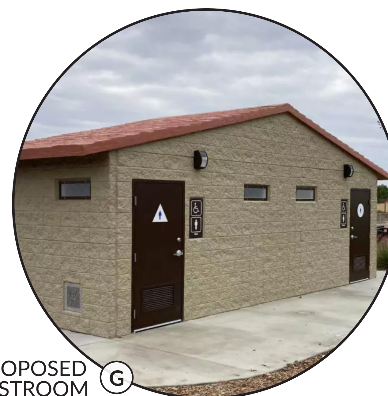
PROPOSED RESTROOM G