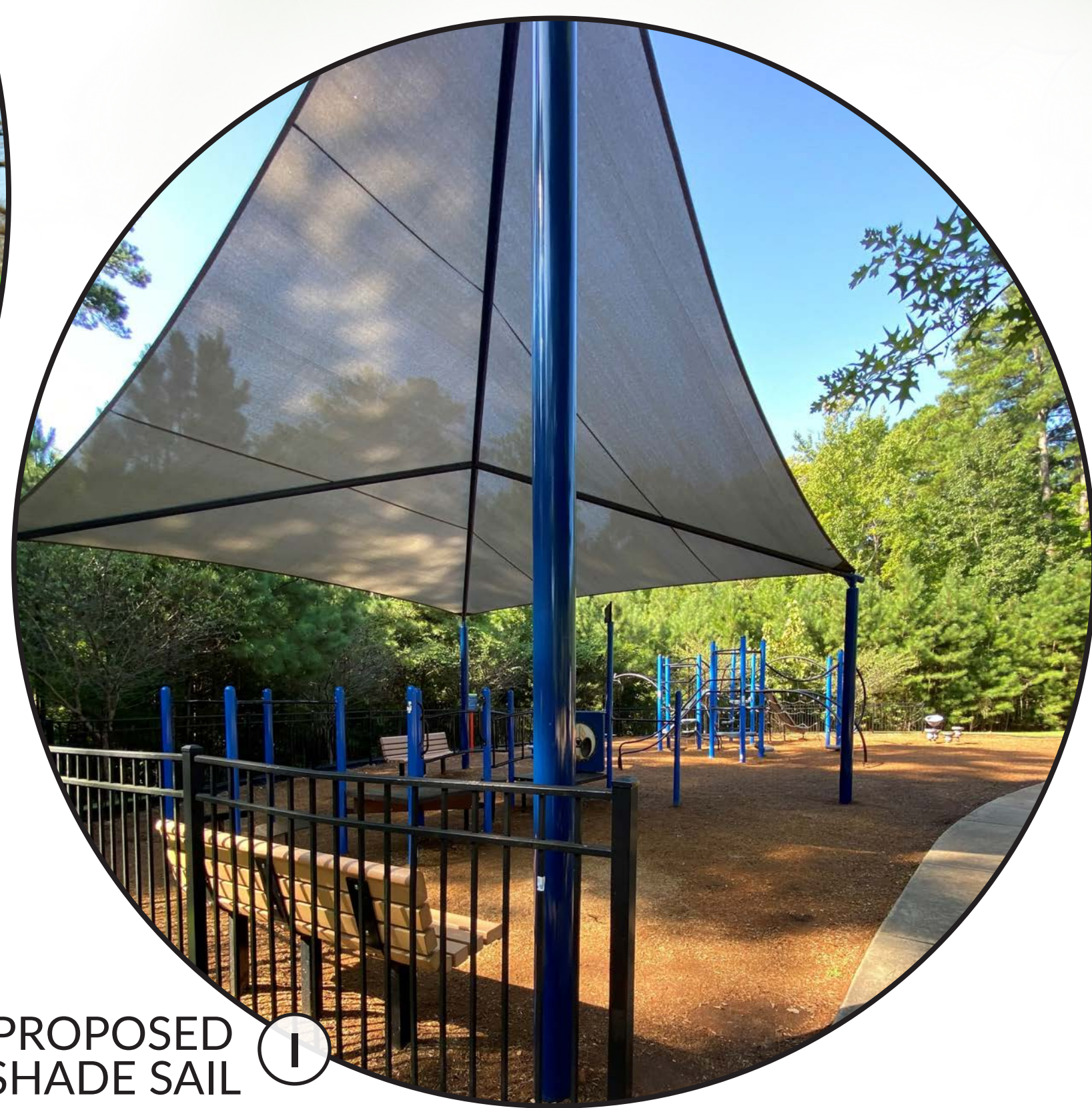
PROPOSED SHADE SAIL I