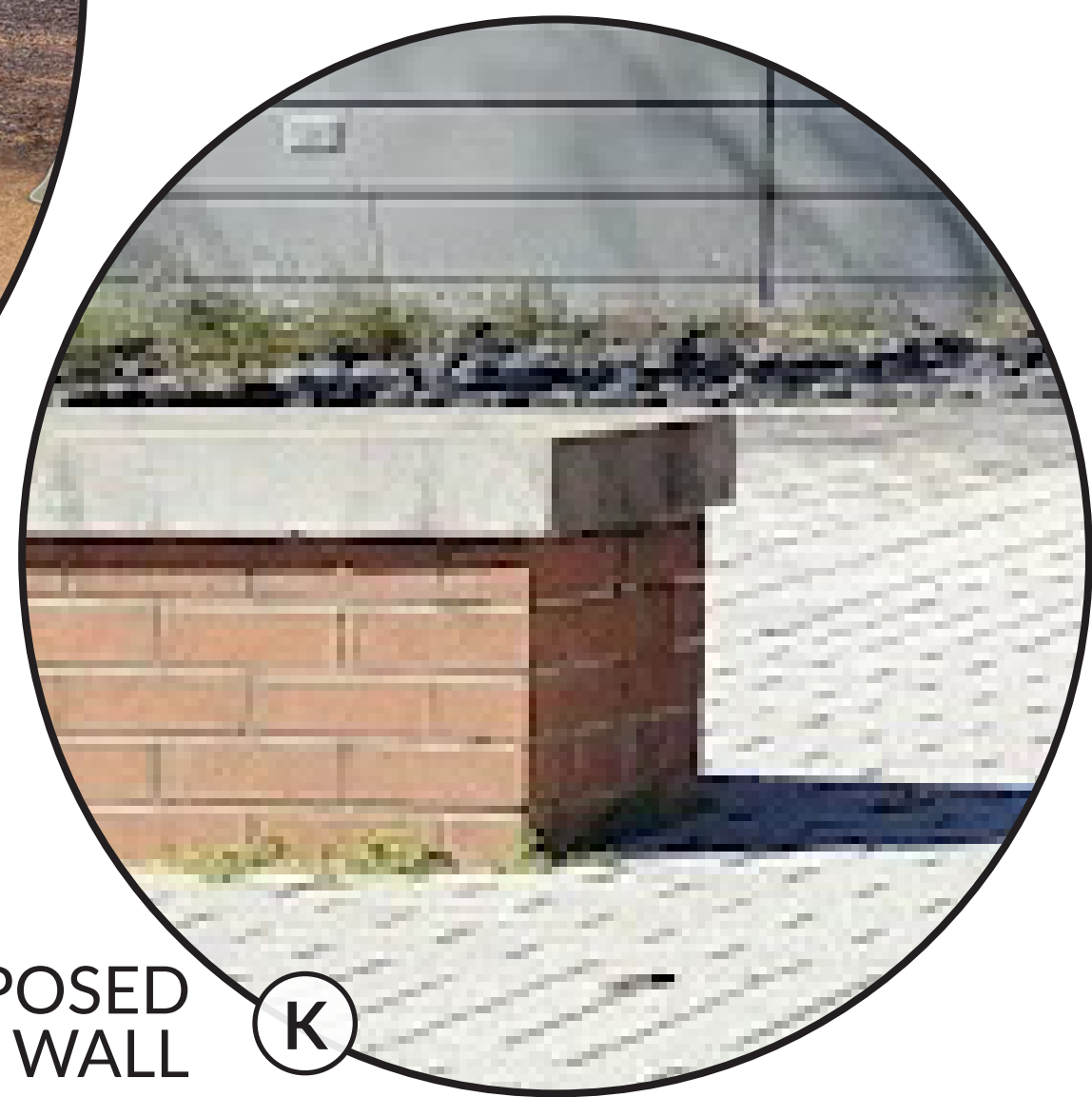
PROPOSED SEAT WALL K