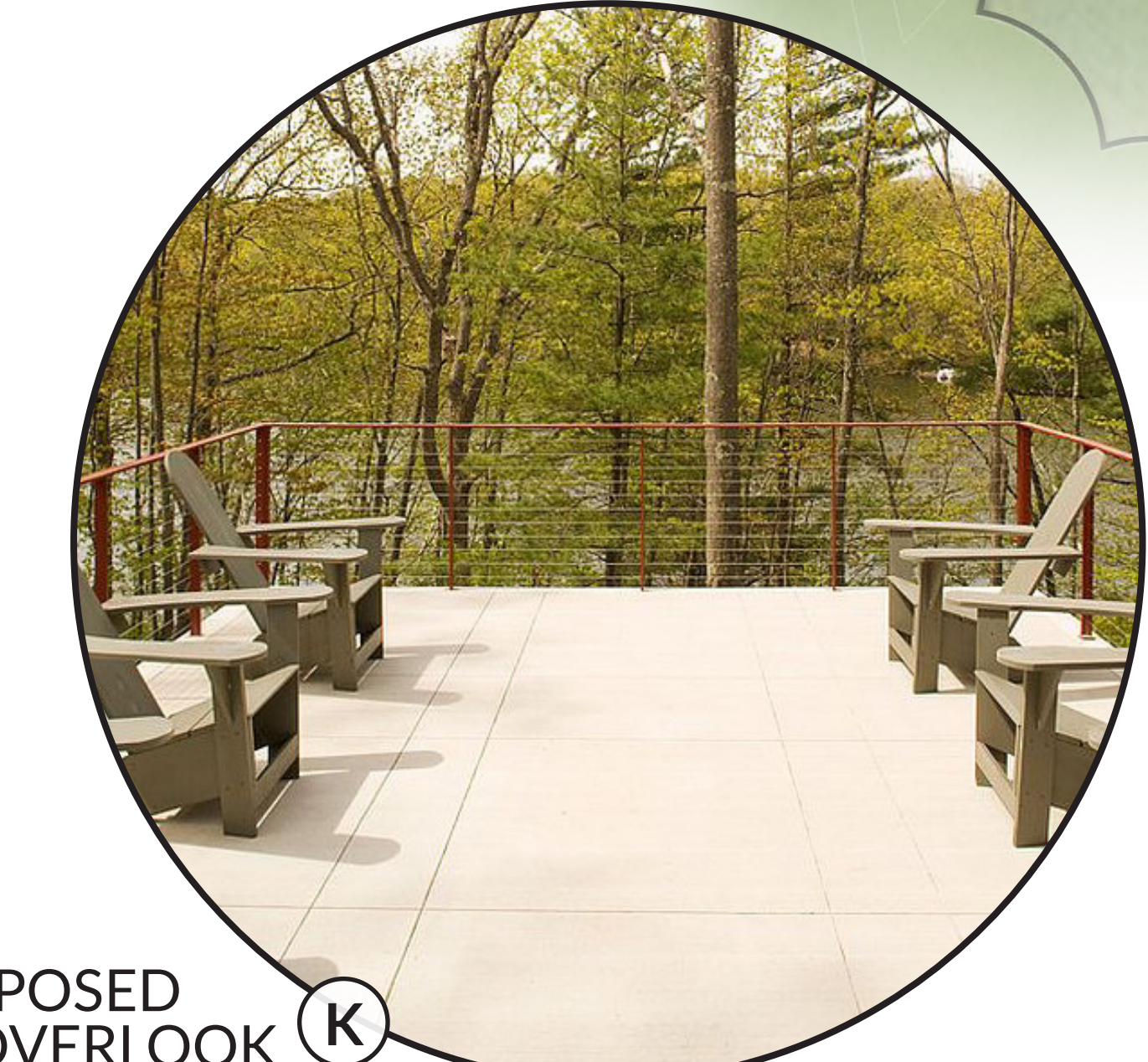
PROPOSED POND OVERLOOK