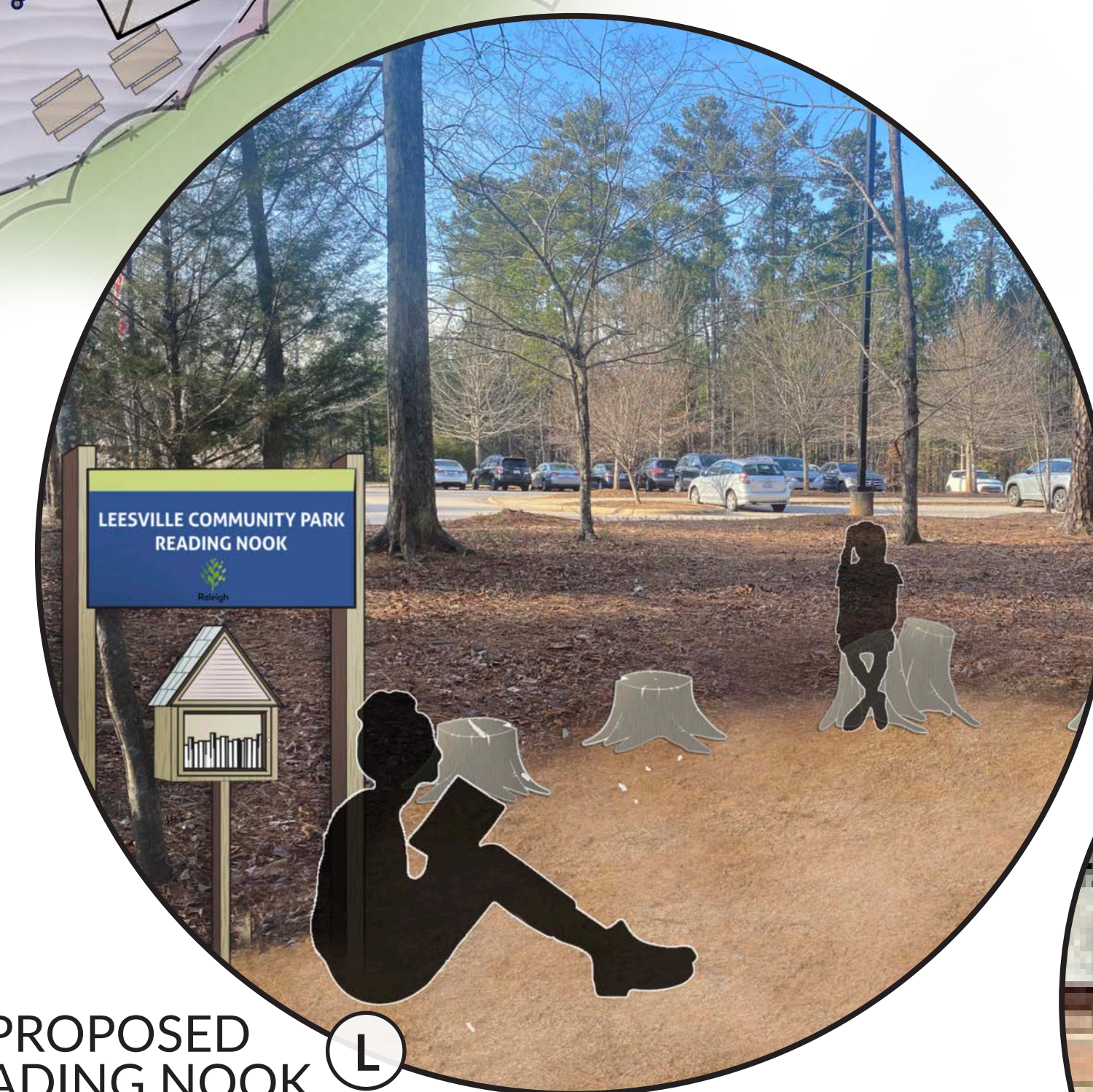
PROPOSED READING NOOK L