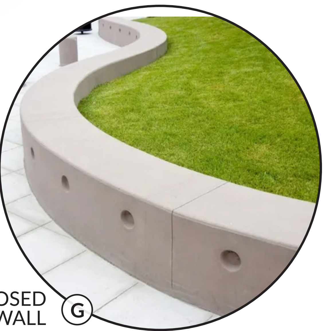
PROPOSED SEAT WALL