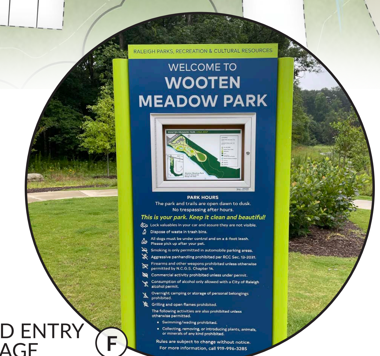
PROPOSED ENTRY SIGNAGE