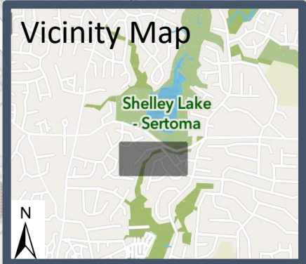
Project Area Map