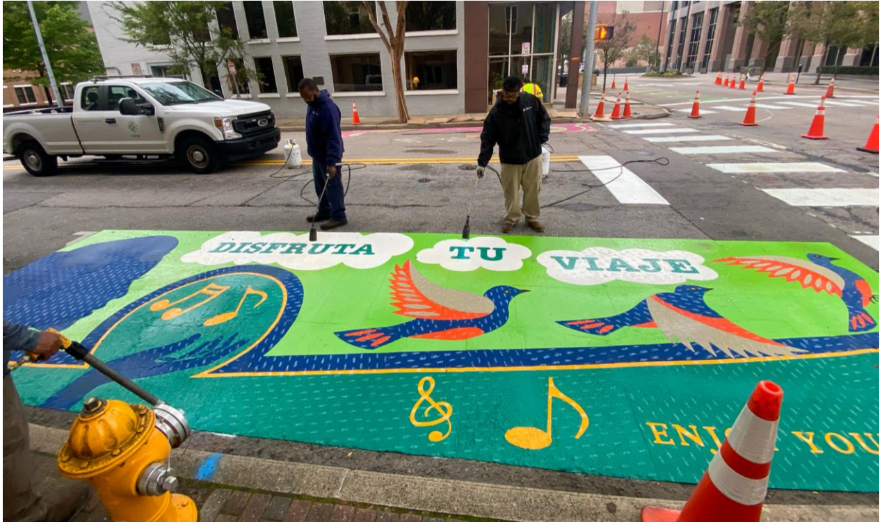
Raleigh Department of Transportation staff use heat to adhere the mural to the pavement