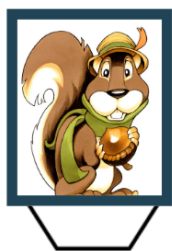
Sammy the Squirrel

(Cut out & fold tab below to make each piece a stand.)