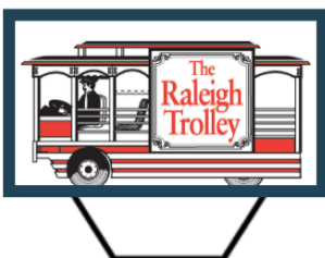
The Historic Raleigh Trolley