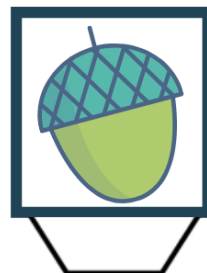
Oak Tree Acorn