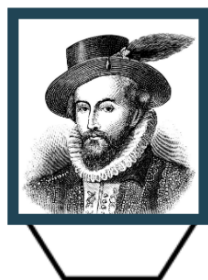
Sir Walter Raleigh