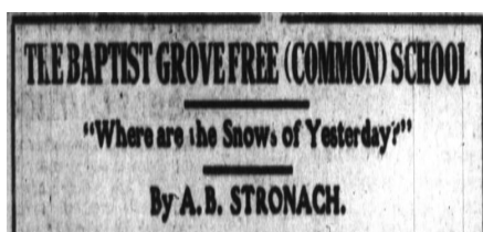
"Baptist Grove (Common) School, By A. B. Stronach" News & Observer , Sunday, Feb. 23, 1908.

Stronach's recollection, published in the News & Observer in 1908, is the most vivid description of the school I've encountered in the historical record. Stronach recalled that the school was "a weather boarded, frame structure . . . 25 or 30 by 50 or 60 feet, running lengthwise north and south, [and] sat exactly in the center of the square." Inside the building, the students, which were all male, sat at "long wood benches, without any backs." Likewise, Stronach remembered that the "teacher's desk [was] a flat top table . . . on a form (platform) two steps rise in the middle of the east wall. From this vantage ground he overlooked the school and from time to time cast his ruler to some offender." Stronach's memoir indicates that several instructors taught at the school during his years as a student. He mentioned several, in particular, including a "Scotchman . . . who was a good teacher, but a man of violent temper," as well as a "Mr. Henry Utley . . . [who] was a good teacher, not overly strict, [and] popular with the boys." However, Stronach thought that "Mr. Womble . . . a strict but good teacher . . . ruled the Baptist Grove better than any teacher in my day."