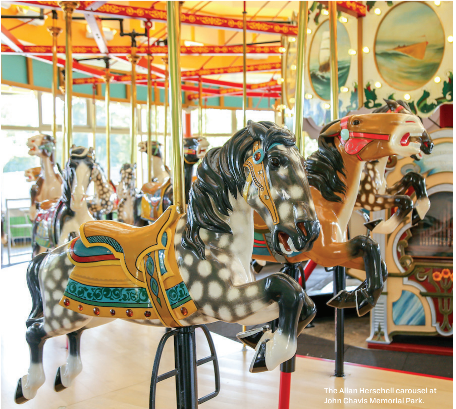
The Allan Herschell carousel at John Chavis Memorial Park.

Official Newsletter of the Historic Resources and Museum Program