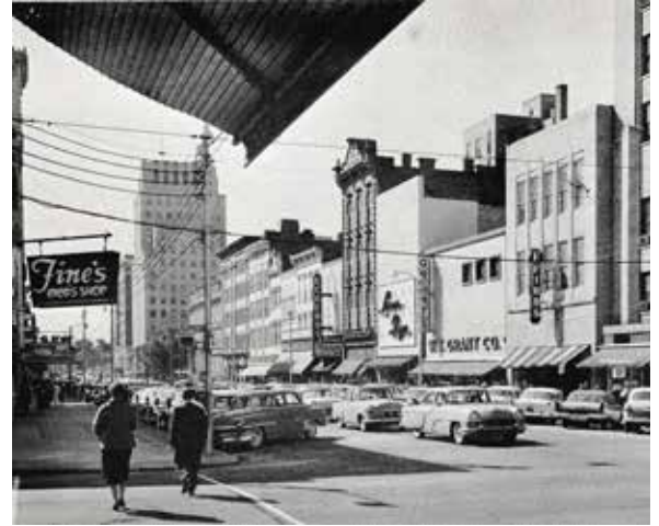
Photograph of Fayetteville Street looking South from Hargett Street, ca. 1961