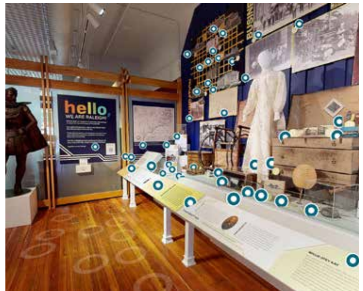
The exhibit Hello, We Are Raleigh! can now be viewed virtually.