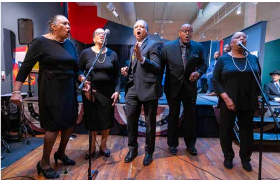
Members of St. Paul's A.M.E. Church perform songs that were a part of historic Emancipation Day celebrations.

Besides new exhibits, the COR Museum has a full slate of fantastic programs. The year began with a bi-monthly lecture series called Timely Connections that explores a wide range of historical topics. The biggest party of the year will be celebrating another birthday. August marks the 50th anniversary of Hip Hop, and the museum is hosting a day-long event of fashion, art, and music. The birthday festivities culminate with a 30th anniversary party in September. It will be a great night to look back at the museum's contributions to the community and plan.