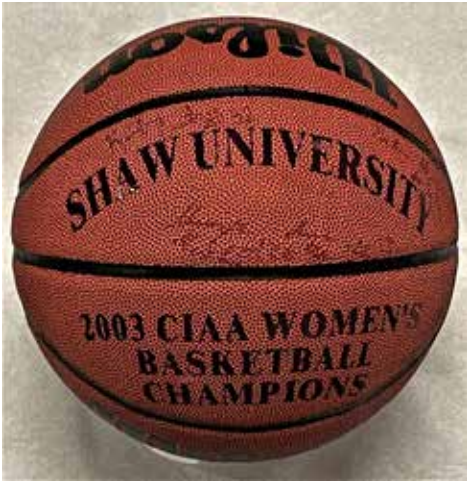
Autographed Shaw University CIAA Women's Basketball Champions, 2003