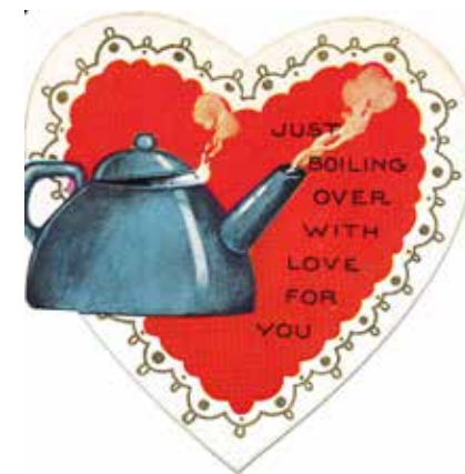
Valentine card, 1930s