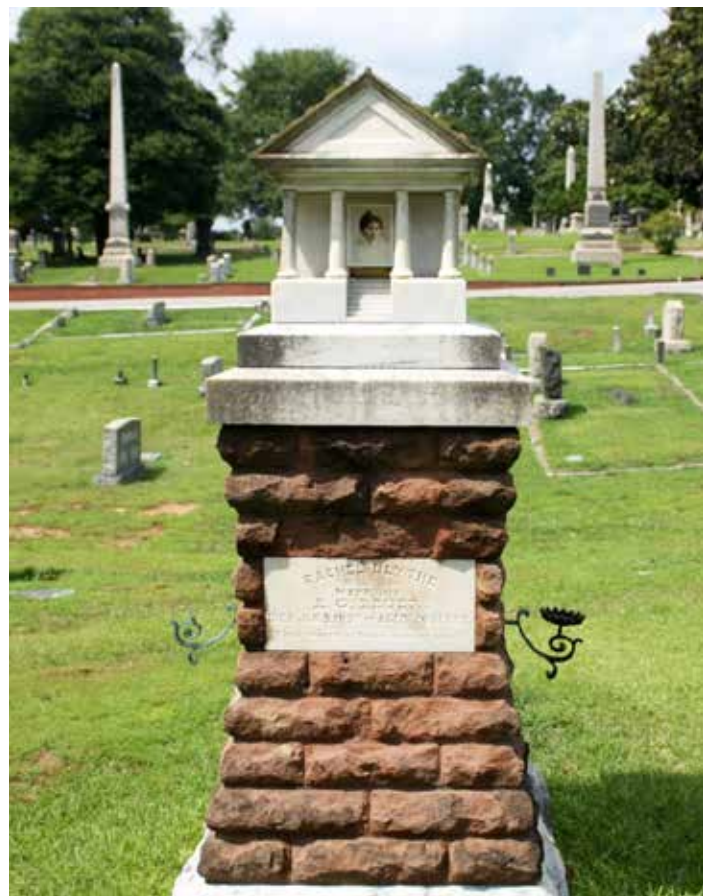
Blythe's headstone is topped with a miniature Greek Temple of Diana.

"In thy dark eyes splendor Where the warm light loves to dwell Weary looks yet tender Speak their last farewell"