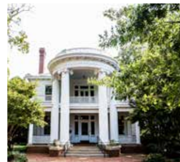
The Tucker House is a beautiful neo-classic revival style home located in downtown Raleigh in the historic Oakwood Neighborhood.

Will the murderer be bride-to-be Hyacinth, trying to escape a marriage she's not sure she wants? Is it disgruntled businessman Carson or scorned sister Jasmine, in an act of revenge? Brush off your detective skills and best 1920s attire and join us to find out!