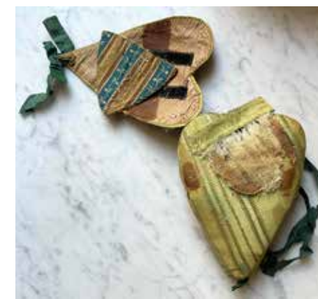
Pincushion, date unknown, Courtesy of Capital Area Preservation, Inc.