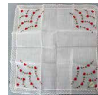
Handkerchief, 20th century