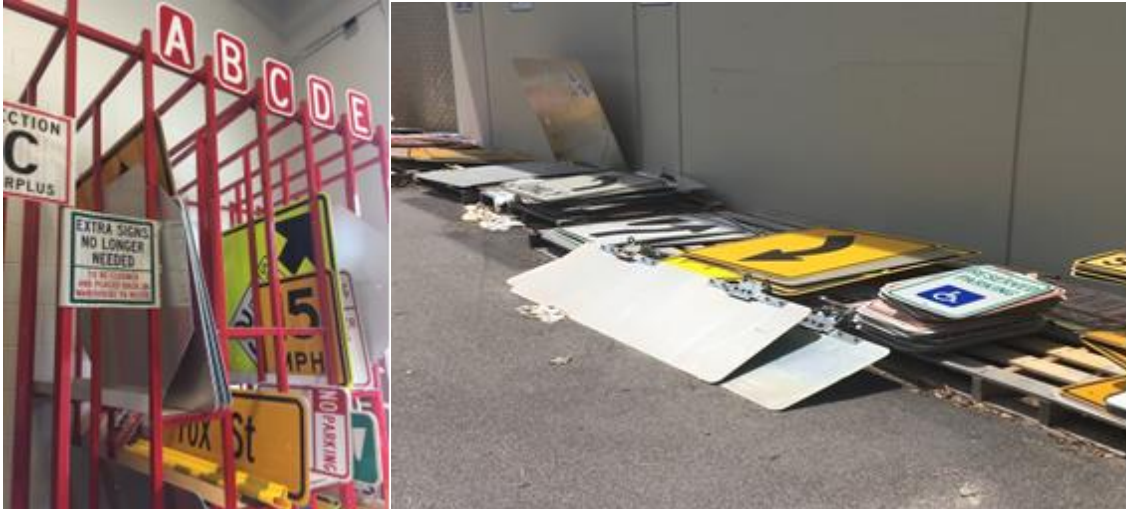
Images from the Raleigh DOT Sign Shop

The selected artist may use the defunct road signs in the recycling pile to create artwork as approved by transportation.