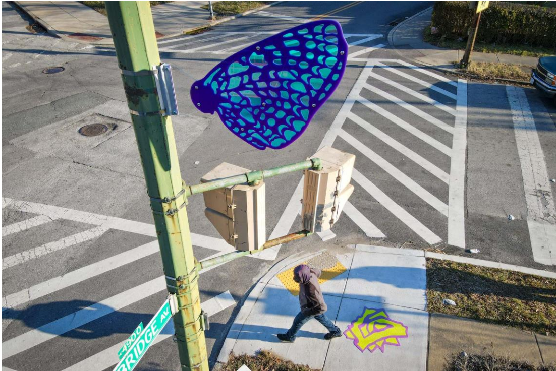
Example Image: Pimlico Wayfinding by Graham Projects