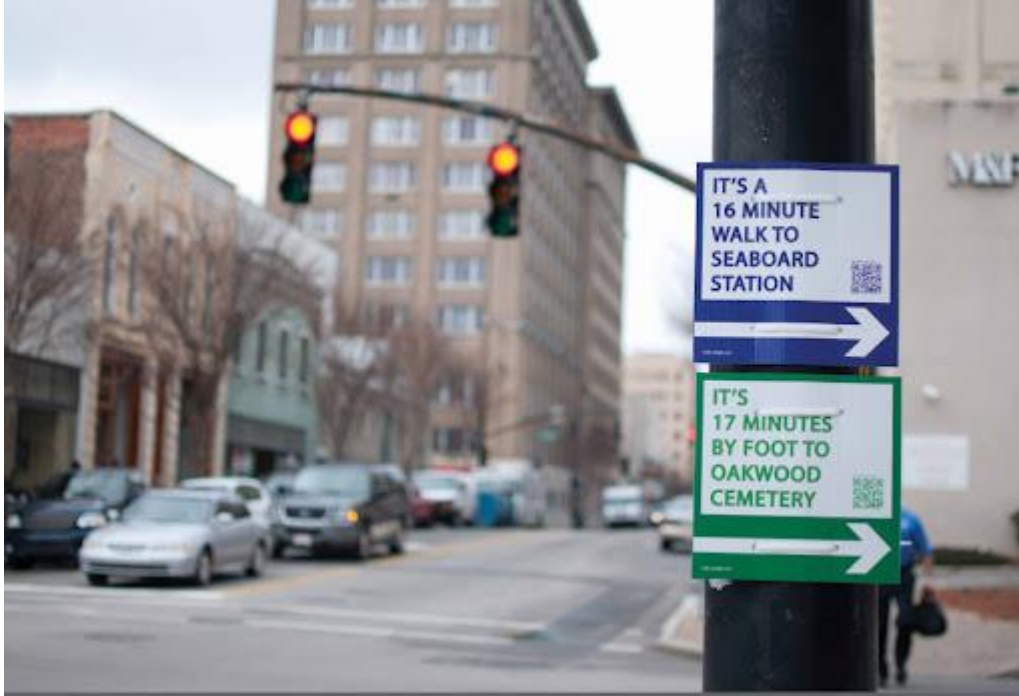
Example image: Walk Raleigh Wayfinding Signs