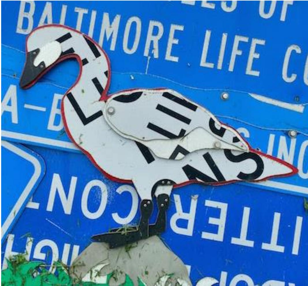
Example image: Artwork from the PennDOT sculpture Garden