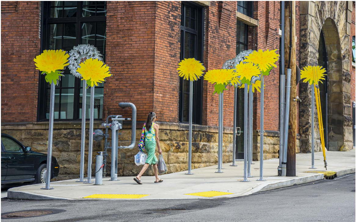
Example Image: Dandelions by artist Carin Mincemoyer