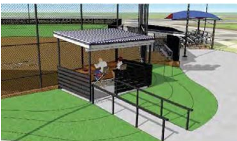
Backstop dugout scoring area

Walnut Creek Athletic Complex is located at 1201 Sunnybrook Road, Raleigh, NC 27610. Easily accessible from Interstate I-40 and Interstate I-440. From I-40 take exit 301 then take exit 15 to Poole Road. From I-440 take exit 15 to Poole Road.