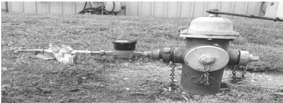
5/8" Hydrant Meters are attached directly to the fire hydrant