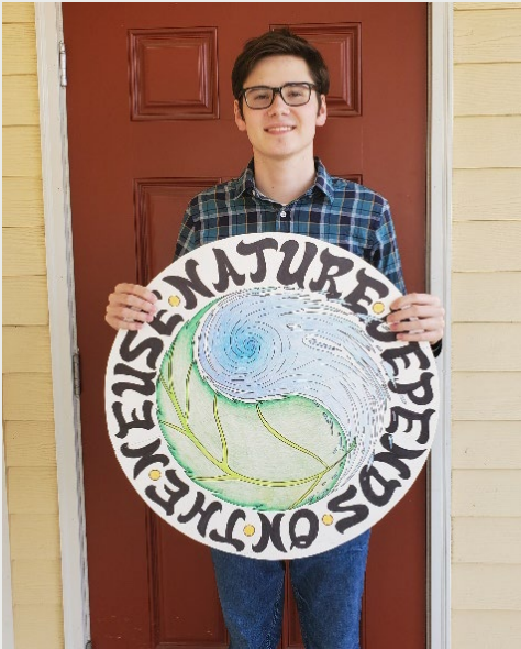
Artwork: "Nature Depends on the Neuse"

The Capture it! Stormwater Arts Contest engages students to demonstrate the environmental importance of stormwater runoff. Each year, an award is given for artwork and videos promoting reductions of stormwater pollution and protection of streams and lakes.