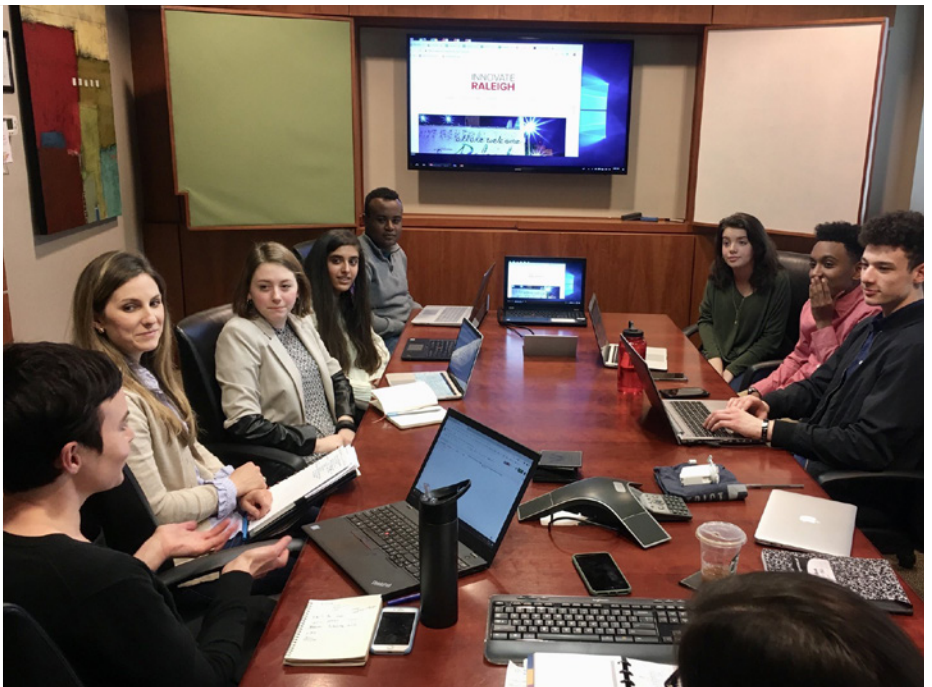
District C students collaborate with Innovate Raleigh to create the Triangle Innovation Hub website.