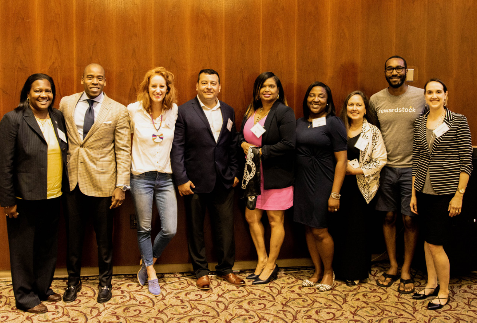
Raleigh Small Business Connect