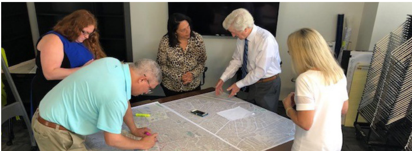
Economic Development Partners discuss the boundaries of their organizations during a quarterly meeting.