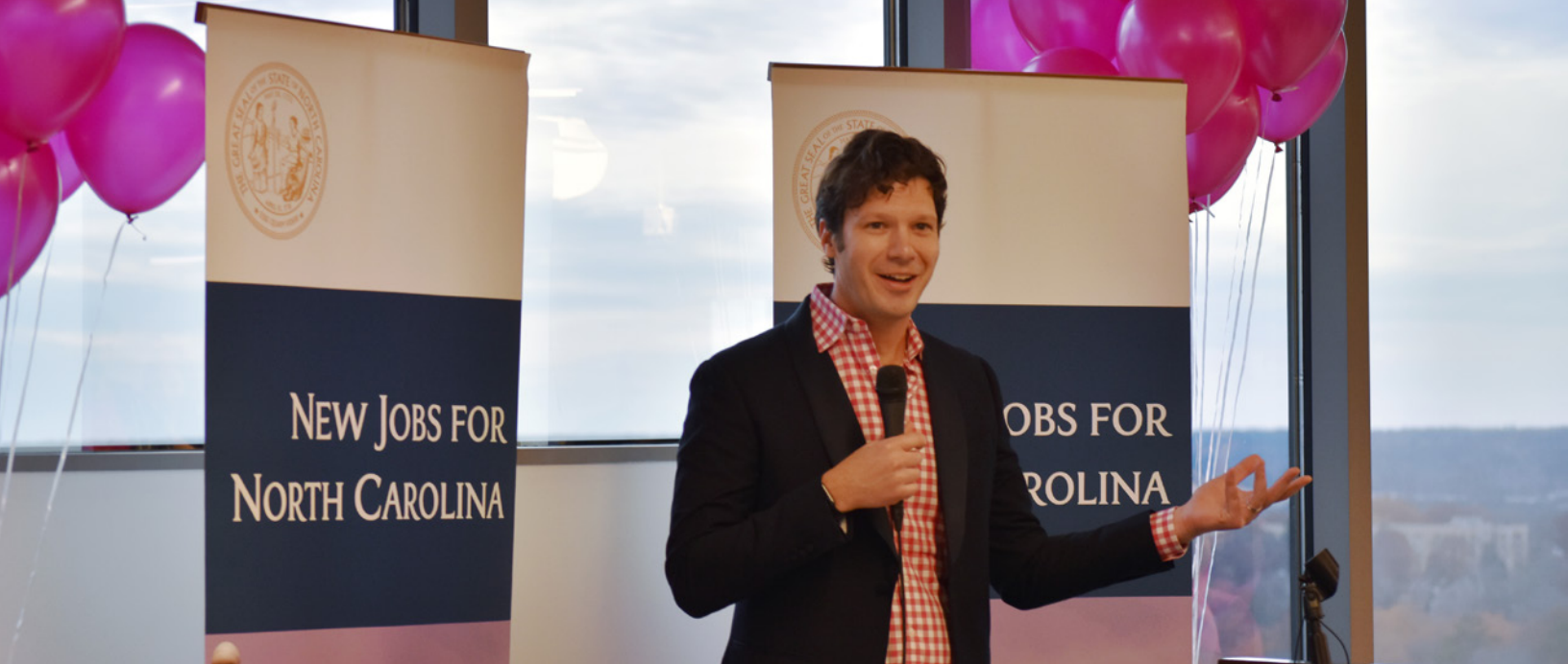
Raleigh Chamber – Pendo announces the addition of nearly 600 jobs at their Downtown Raleigh headquarters.

Thank you to our partners for your work in advancing economic development initiatives that create, grow and make prosperity attainable for all in our community.