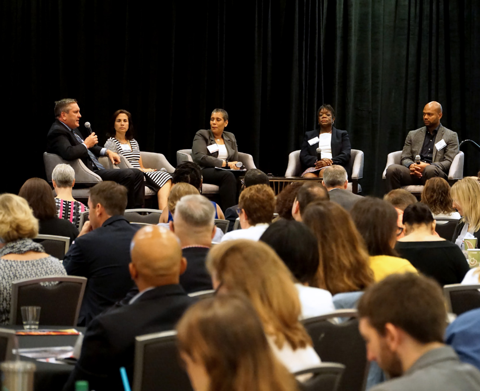
Raleigh Chamber 2018 Diversity, Equity, and Inclusion Conference