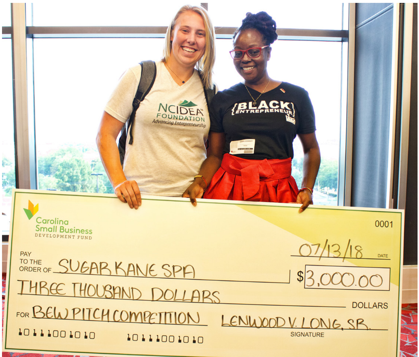
BEW Pitch Competition Winner