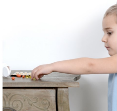
KEEP OUT OF REACH